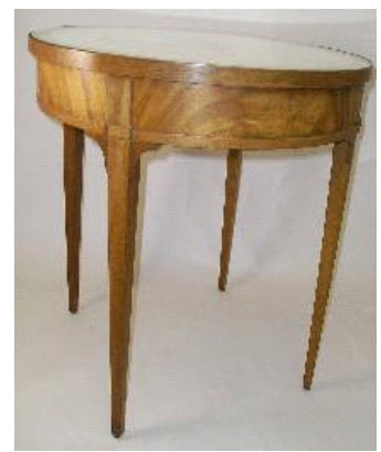
Lot # 83

83 19th century mahogany circular side table.