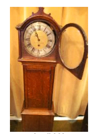
Lot # 282

282 Scottish small oak cased floor standing or Grandmother clock by Chas.Brown-Edinburgh. $300 - $500