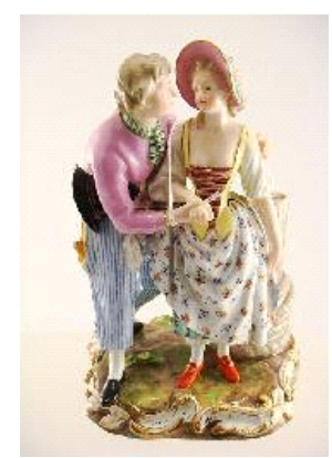
Lot # 167

167 Continental china figure group with crossed swords mark- Courting couple.