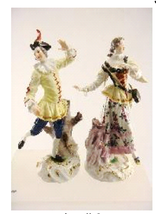
Lot # 3 3 Pair of Continental china figurines with crossed swords marks-Fleeing couple, ht. 7in.