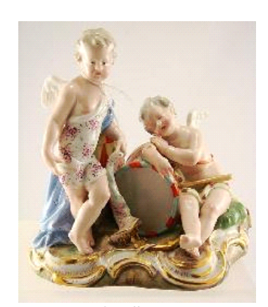
Lot # 304 304 Continental china figure group with crossed swords mark-"Two Putti with Drums", ht.6 1/4in. $200 - $300