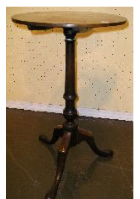
Lot # 278

278 Georgian inlaid mahogany tilt top pedestal table.