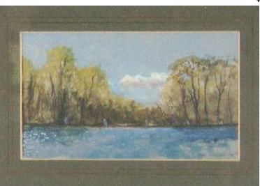
Lot # 291