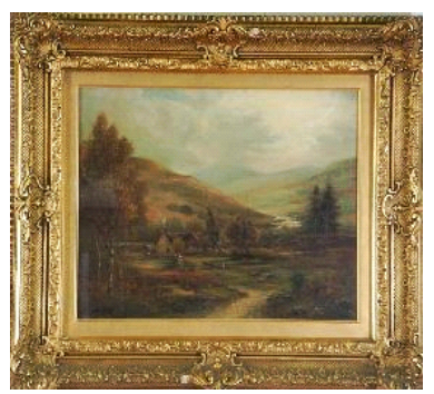
Lot # 306

306 Framed oil on board signed J. Ramsay, 10 x 12 inches, "Highland Scene w.Thatched Cottage".