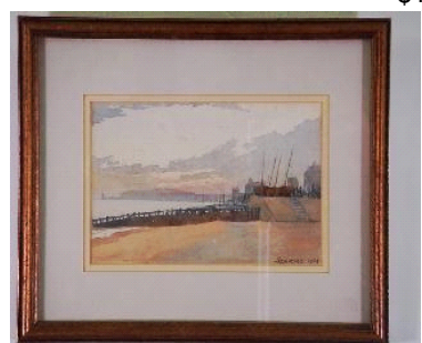
Lot # 288A

288A Watercolor signed verso A.B. Yeats, 4 1/2" x 7", "Seaford 1914".