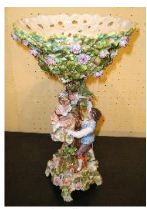
Lot # 322

321 Pair of Continental painted & floral encrusted china two handled covered vases, ht. 18 in. $150 - $250