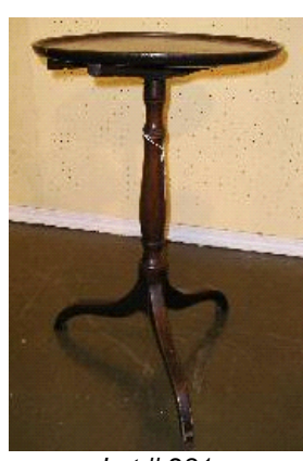
Lot # 281

281 Late Georgian tilt top tripod table.