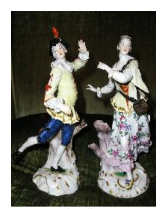
Lot # 3

3 Pair of Continental china figurines with crossed swords marks-Fleeing couple, ht. 7in.