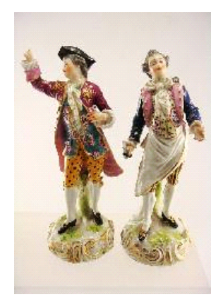
Lot # 166 166 Two Continental china figurines of standing men with orange crown marks,ht. 7 1/2in.