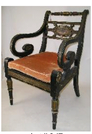
Lot # 247

247 Pair of parcel gilt ebonized open armchairs in the Empire manner.