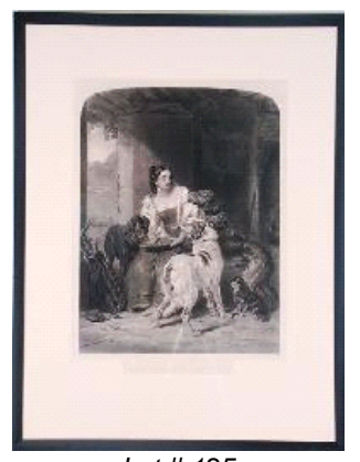
Lot # 125