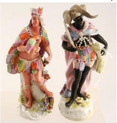
Lot # 230

230 Two Continental china figurines- Black Moor w.Elephant hat & Woman w. Feather Cape,ht.6in.