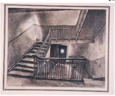
Lot # 41

41 Graphite signed Susan King 1983, 8" x 11", "Staircase".