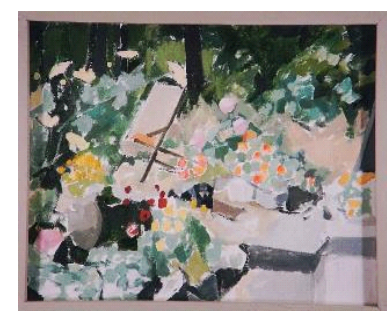
Lot # 15

15 Oil on canvas signed verso Elizabeth Kerfoot, 11 x 14 inches, "Garden View with Dog".