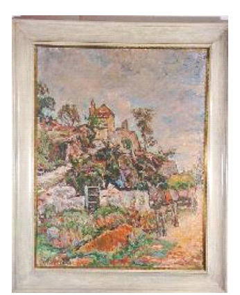
Lot # 180A

180 Lot of red and gold porcelain pieces