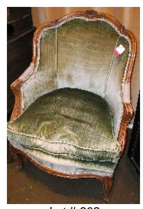
Lot # 308 308 Louis XV style upholstered Bergere.