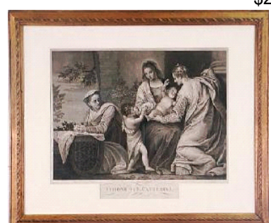
Lot # 305 305 Engraving by Giovanni Vendramini, 16"x 21", "The Vision of St. Catherine".