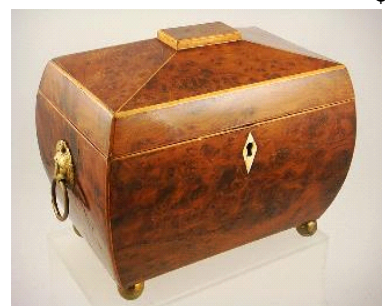
Lot # 235

235 Early Victorian yew wood casket form tea caddy. $500 - $700