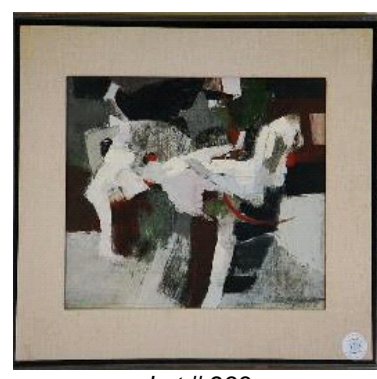
Lot # 293

293 Oil painting signed Lionel Gilbert, 10" x 12", "Horse Show".