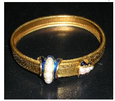
Lot # 100

100 Victorian 18k enamel and pearl slider bracelet, approx. 31 grams.