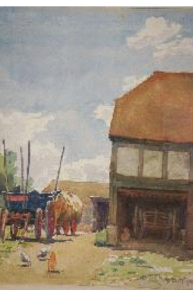
Lot # 250

249 Oil painting on board initialed A.B., "Lake View". $200 - $300