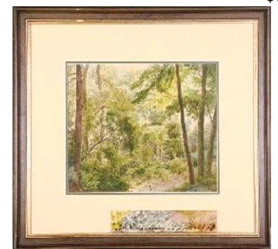
Lot # 171

171 Watercolour indistinctly signed, 8 3/4 in. x 11 in., "Forest Garden".