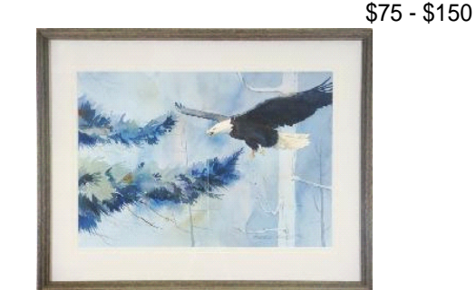
Lot # 241

241 Watercolour signed Bruce Cryer, 13 in. x 20 1/2 in., "Eagle in Flight".