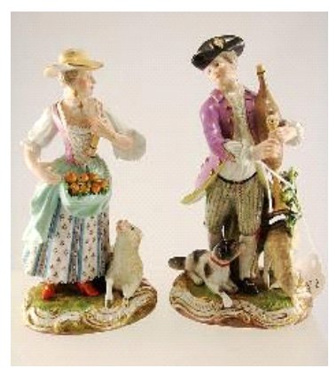
Lot # 303

303 Pair of Continental china figurines with crossed swords marks-Man w.Bag Pipe & Woman w.Fruit ht.6"