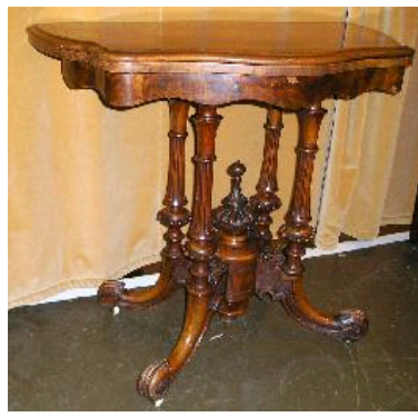
Lot # 315

315 Victorian good quality burr walnut fold over parlor table.