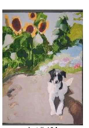
Lot # 10A

10A Oil on canvas signed verso Elizabeth Kerfoot, 14 x 11 inches, "Sunflowers with Dog".