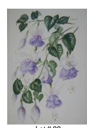
Lot # 22

22 Watercolour signed E.(Emily) Sartain, 13 1/2 in. x 9 1/2 in., "Fuchia".