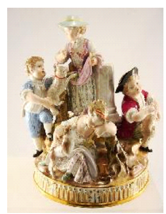
Lot # 237

237 Continental china figure group with crossed swords mark-Five Children with Animals,ht.7in. $250 - $350