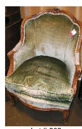
Lot # 308