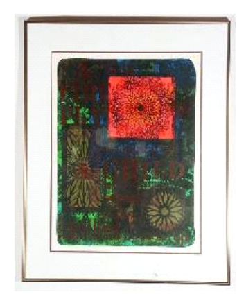
Lot # 35