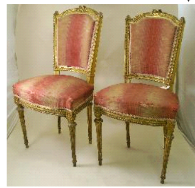
Lot # 267

267 Pair of Louis XVI style giltwood side chairs.