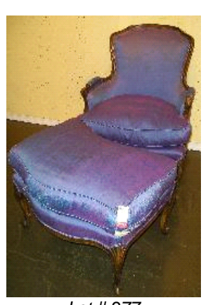
Lot # 277 277 Louis XV style upholstered berger with matching footstool.