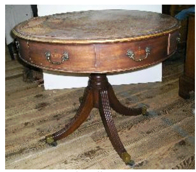
Lot # 270

270 19th century leather inset mahogany rent table.