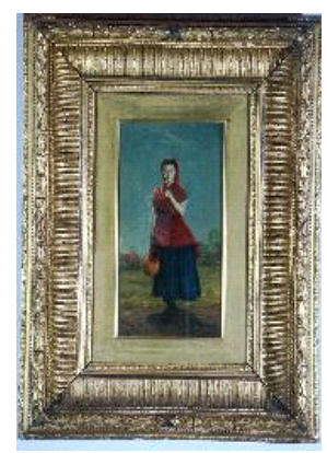
Lot # 285

285 Oil painting on board signed J. Burr, 10 3/4" x 22 1/2", "Portrait of a Young Lady".