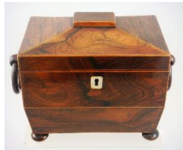
Lot # 231