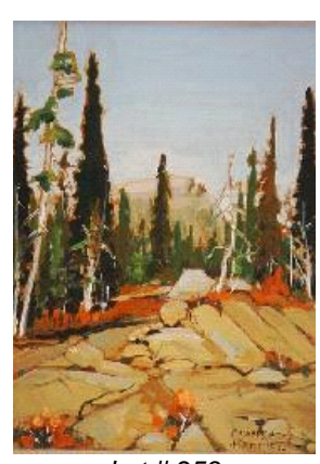
Lot # 259