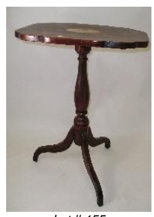
Lot # 155