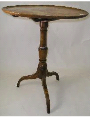
Lot # 219

219 Georgian mahogany tilt top pedestal table.