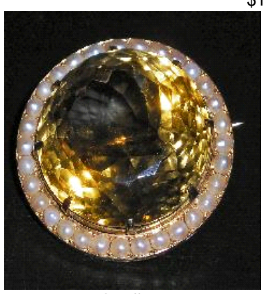
Lot # 92

92 Victorian 14k citrine and pearl brooch pendant, approx. 87 cts.