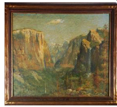
Lot # 215