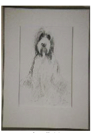
Lot # 11

323 Large Louis XVI-style basket-form chandelier. $1,000 - $1,500