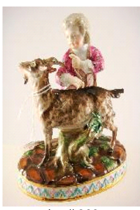
Lot # 233

232 Continental china figurine of a lady with a rose. $50 - $100