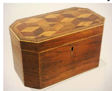
Lot # 239

239 Victorian parquetry inlaid rosewood tea caddy.