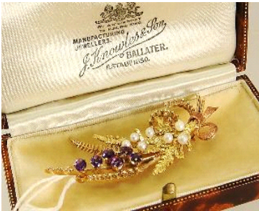
Lot # 2

1 14 kt yellow and pink gold floral brooch. $150 - $250