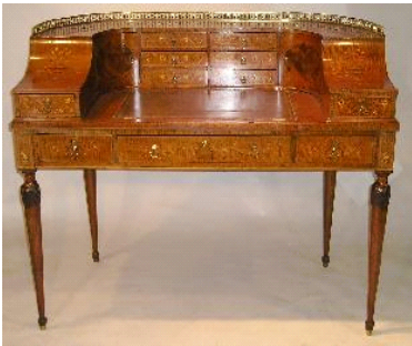
Lot # 461

461 Marquetry inlaid mahogany Carlton House desk, late 19th century. $3,000 - $4,000