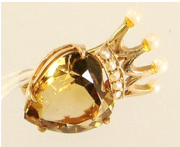
Lot # 6

5 9 kt. gold and garnet crescent shaped brooch. $100 - $150