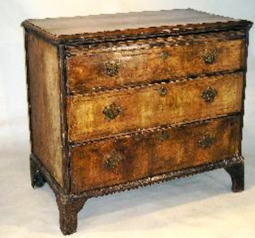
Lot # 370