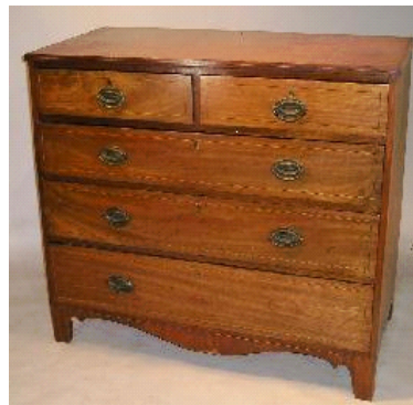
Lot # 321