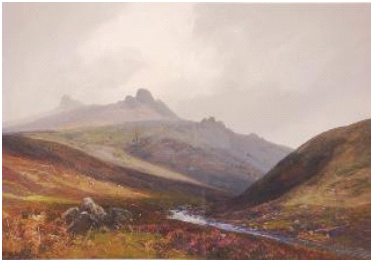
Lot # 420

419 Pair of German porcelain figurines of a courting couple. $150 - $200