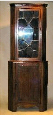
Lot # 376

376 19th century mahogany corner cabinet. $200 - $400