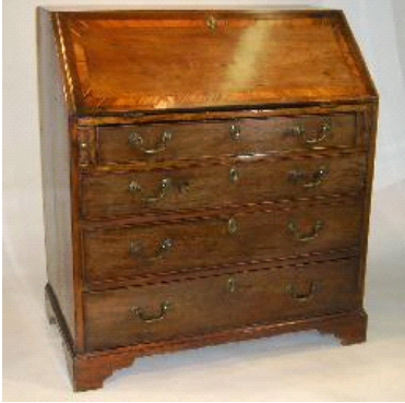
Lot # 394

393 Continental painted figural comport. $50 - $100