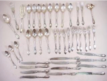
Lot # 357

356 8 assorted pieces of coloured stemware. $100 - $150