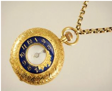
Lot # 9

8 1940s Omega lady's military style wristwatch. $50 - $75