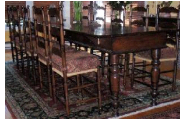
Lot # 326