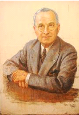
Lot # 167

166 Oil on board signed L. Pavelic, 8 x 7 1/2", "Young Girl with Flowers". $25 - $50