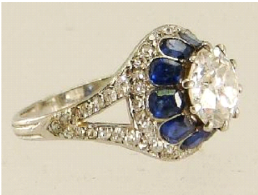
Lot # 36

36 Art Deco Platinum diamond and sapphire ring, centre stone 1.35ct, SI-1, with appraisal. $3,000 - $5,000