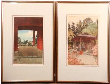
Lot # 439

438 Chinese 18th century brown glazed porcelain pillow in the shape of a cat. $75 - $100