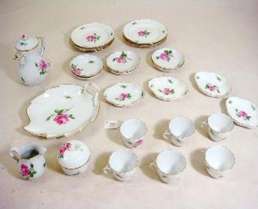
Lot # 372