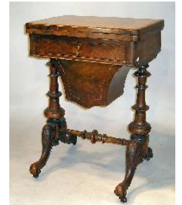
Lot # 337