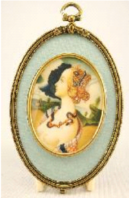
Lot # 204

203 Victorian maple dresser mirror. $100 - $150