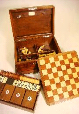
Lot # 452