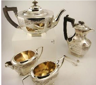
Lot # 307