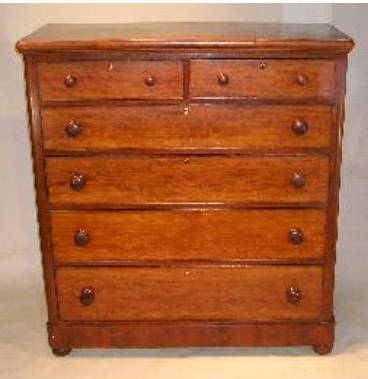
Lot # 247

246 Paper papier mache dish on stand. $25 - $50