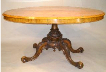
Lot # 406

405 Pair of Victorian chairs. $75 - $125