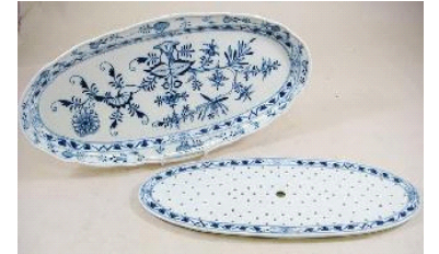
Lot # 334