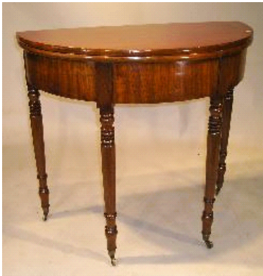
Lot # 459

458 Dutch parcel gilt walnut chest of drawers, with splayed cabriole legs. $1,500 - $2,500