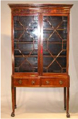
Lot # 430

429 Alabaster carving a young girl. $40 - $60