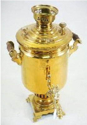
Lot # 368