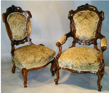
Lot # 444

439 Pair of Japanese woodblocks, 15" x 10", one signed Hiroshi Yoshida. $600 - $800 440 Lot of green glazed dishes. $50 - $100 441 Late 19th century cast copper mirror with attached sconce. $75 - $125 442 19th century gilt gesso framed pier mirror. $100 - $150 443 Late 18th./early 19th. century painted lace fan & giltwood fan in a shadowbox frame. $200 - $300