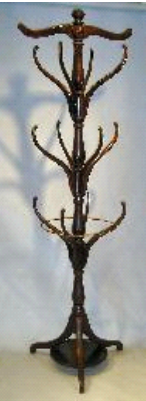
Lot # 448