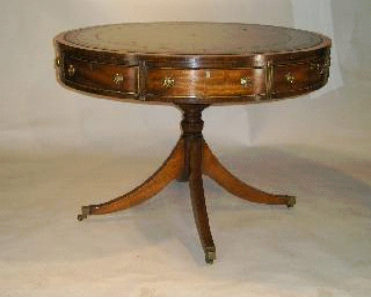
Lot # 214

213 Miniature painting of the Duchess of Marlborough. $200 - $300