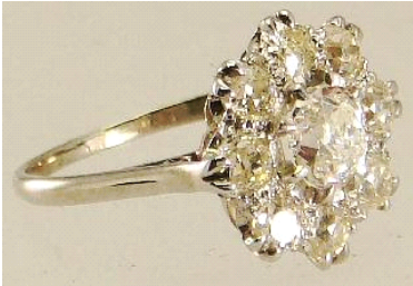
Lot # 37

36 Art Deco Platinum diamond and sapphire ring, centre stone 1.35ct, SI-1, with appraisal. $3,000 - $5,000