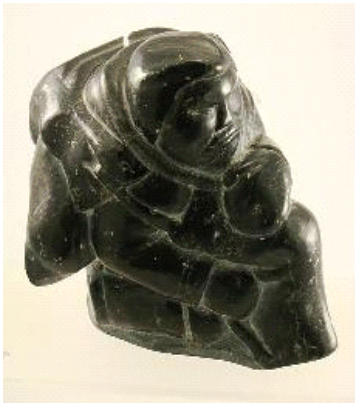
Lot # 432

432 Inuit soapstone carving signed with disc number(possibly E9-1447 Lukassie Tukalak),ht.5 1/4 $150 - $300