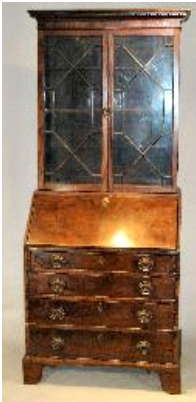
Lot # 460

459 Georgian mahogany fold-over table. $1,000 - $1,500