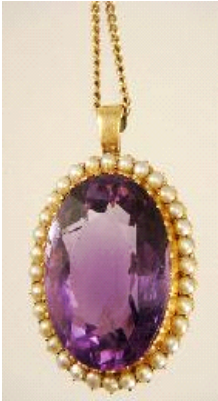
Lot # 17

17 Yellow gold, amethyst and seed pearl pendant necklace.