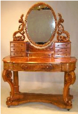
Lot # 374

373 Oil painting on canvas unsigned "Mexican Potter". $50 - $100