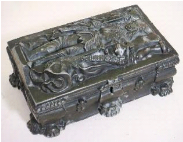
Lot # 433

432 Inuit soapstone carving signed with disc number(possibly E9-1447 Lukassie Tukalak),ht.5 1/4 $150 - $300