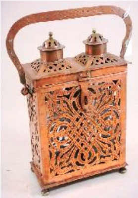
Lot # 363