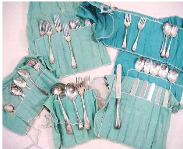
Lot # 310