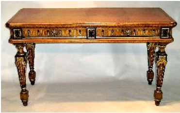
Lot # 462

461 Marquetry inlaid mahogany Carlton House desk, late 19th century. $3,000 - $4,000