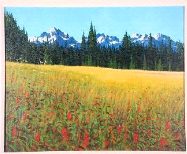
Lot # 183

182 Victorian rosewood needlepoint upholstered balloon back side chair. $50 - $100