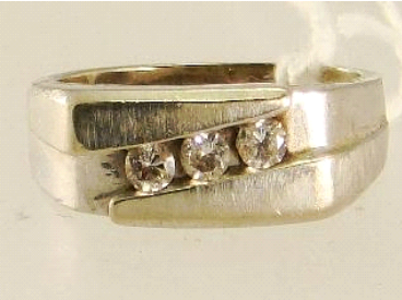
Lot # 27

27 14k white gold and diamond wedding band, designed by Ben Moss.