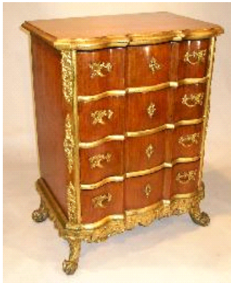
Lot # 458

458 Dutch parcel gilt walnut chest of drawers, with splayed cabriole legs. $1,500 - $2,500