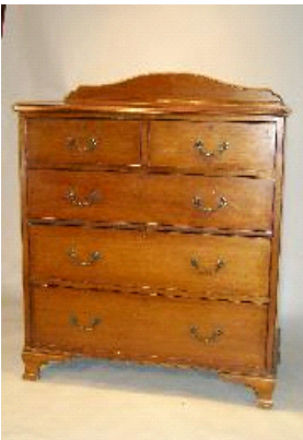
Lot # 381

381 19th century mahogany chest of drawers. $250 - $350