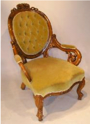
Lot # 389

389 Victorian walnut upholstered parlor chair. $250 - $500