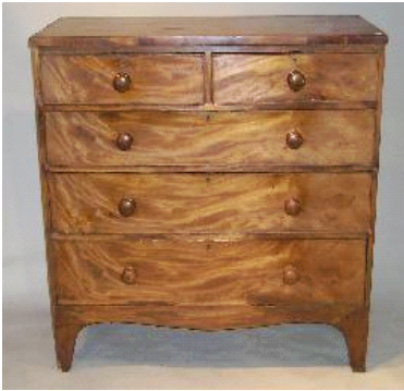
Lot # 157

156 Watercolour signed Bonli, 14 in. x 21 in., "Forrest Stream". $50 - $75