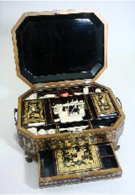
Lot # 413

412 Canadian blue art glass pitcher with mark on handle-Burlington Glass Works, height 8 1/2 in. $50 - $75