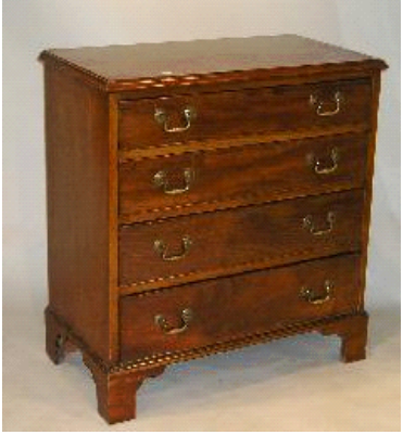
Lot # 398

397 Mahogany and brass book slide with celluloid decoration. $50 - $75