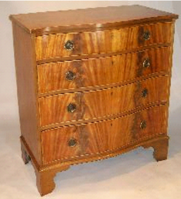
Lot # 414

413 Early 19th century Chinese sewing box with ivory implements. $250 - $500