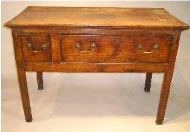
Lot # 343

342 Lot of 19th century china part dinner service. $25 - $50