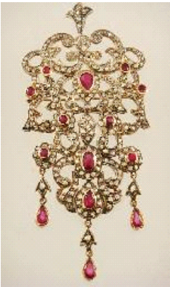
Lot # 38

37 14kt white gold and diamond cluster ring. $1,800 - $2,200