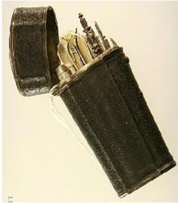
Lot # 1

1 Continental silver and snake skin fitted "etui". $200 - $300