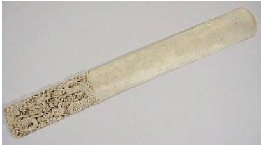
Lot # 11