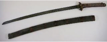
Lot # 223

222 Pair of blue opaline glass bud vases. $5 - $10