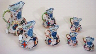
Lot # 233

232 Victorian mahogany sideboard. $200 - $300