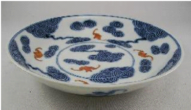
Lot # 9