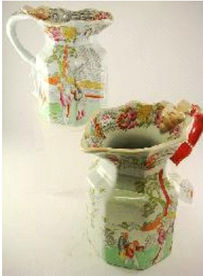
Lot # 313