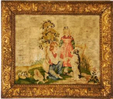
Lot # 35