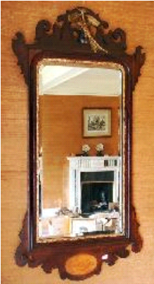
Lot # 321