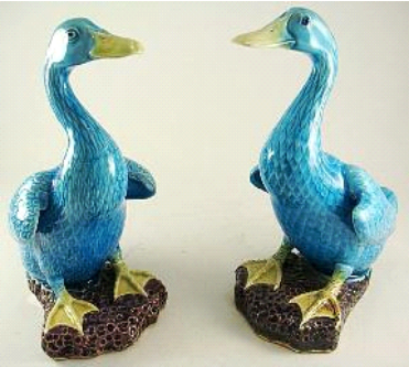
Lot # 328

328 Pair of 19th century blue glazed ducks.