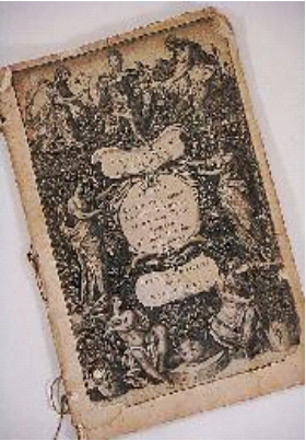
Lot # 224

223 Japanese katana (long sword) with scabbard, length approx. 36 in. $1,000 - $1,500