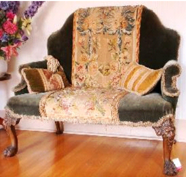
Lot # 303