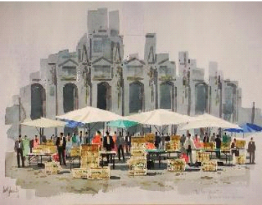
Lot # 28

28 Watercolour indistinctly signed, 17 in. x 23 in., "The Bird Market, La Grande Place, Bruxelles"