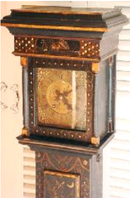
Lot # 300