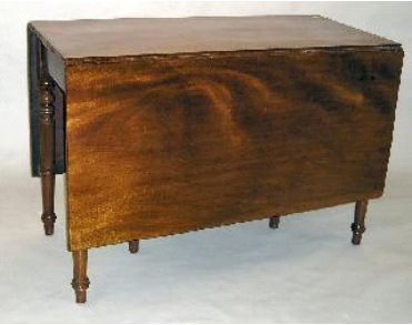
Lot # 228

227 Mahogany shield back chair. $100 - $150