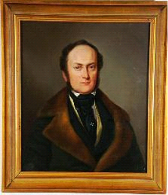
Lot # 339