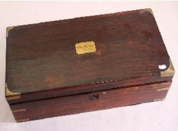
Lot # 115