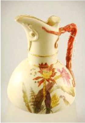
Lot # 16

16 Worchester hand painted pitcher with twig stem.