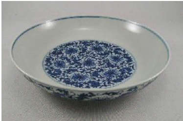
Lot # 12