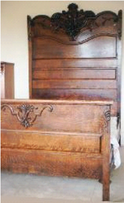
Lot # 51