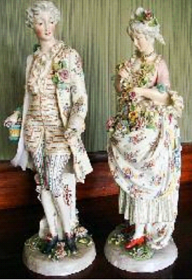
Lot # 345