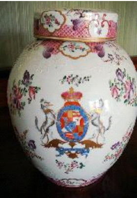
Lot # 323