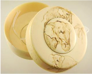
Lot # 7