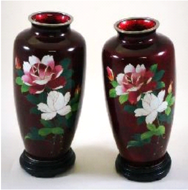
Lot # 196

196 Pair of cloisonne enamel floral decorations. $600 - $800