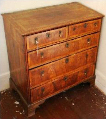
Lot # 172

221 Continental cast iron casket shaped dresser box. $25 - $50