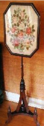
Lot # 286