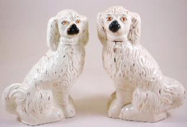
Lot # 288