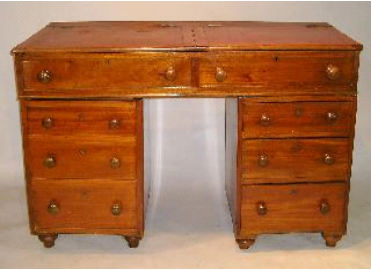
Lot # 164

164 19th. century mahogany campaign desk- possibly from Hudson's Bay Company. $350 - $450