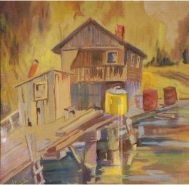
Lot # 340