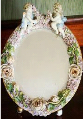
Lot # 326

326 19th century French porcelain putti figured dresser mirror.