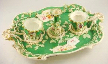
Lot # 87