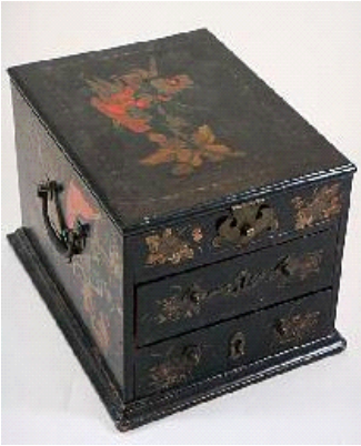
Lot # 173

172 Georgian cross-banded walnut chest of drawers. $1,250 - $1,750