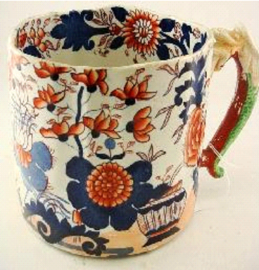
Lot # 174

173 Early 20th century Chinese lacquered dresser box. $100 - $150