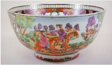
Lot # 162

161 Watercolour signed G. Massa, 8"x 12" "St. Paul de Neue". $50 - $75