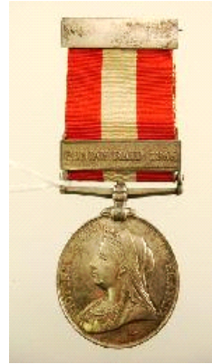
Lot # 2

1 Continental silver and snake skin fitted "etui". $200 - $300