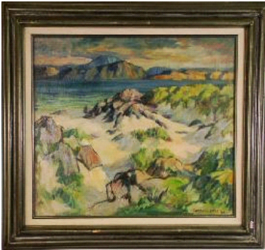
Lot # 157

156 Unsigned oil painting on board, 11 in. x 15 in., "Hayfield with Village in Background". $100 - $200