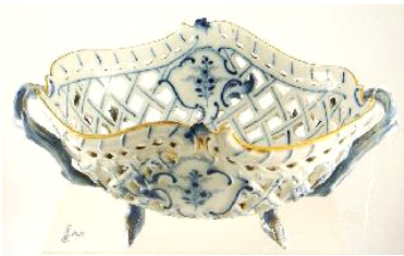
Lot # 327

327 Meissen blue and white two handled pierced basket, 10 1/4".