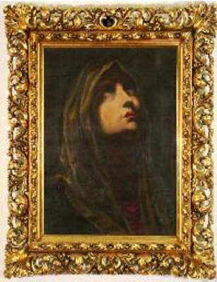
Lot # 331

331 Unsigned oil painting on canvas in a pierced gilt frame, 17"x13 1/2", "Young Lady in Thought".