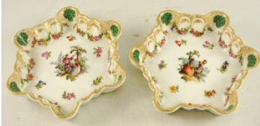
Lot # 289

289 Pair of Augustus Rex hand painted dishes.