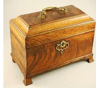
Lot # 307

306 Unsigned gouache on paper, "Forest Landscape". $20 - $30