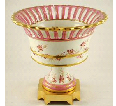
Lot # 309

308 Late Georgian mahogany commode. $250 - $350