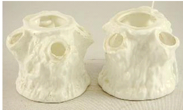
Lot # 5

4 Porcelain dresser clock stamped "Patented 16 July 1895". $20 - $40