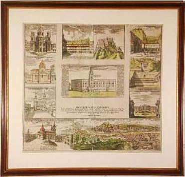
Lot # 58