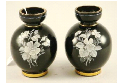
Lot # 284

284 Pair of hand painted and gilded black glass vases.