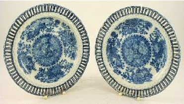
Lot # 276