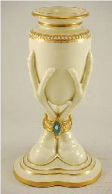
Lot # 247