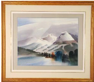
Lot # 27

27 Coloured print signed Onley, "Blackcomb from Alta Lake"