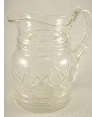
Lot # 277