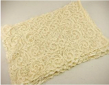
Lot # 13