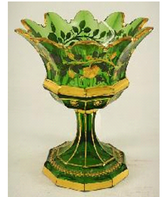
Lot # 285

285 Small gilded green glass pedestal vase.