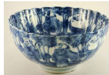
Lot # 278