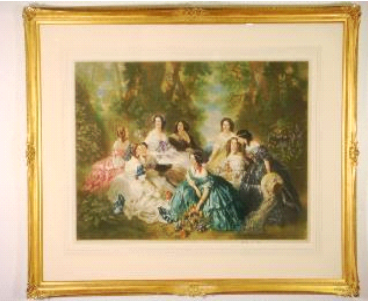
Lot # 51