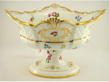
Lot # 18