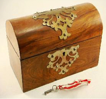
Lot # 301

301 Victorian walnut casket shaped tea caddy fitted as a letter box.