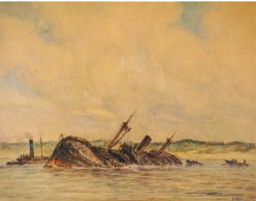
Lot # 264