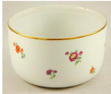
Lot # 10