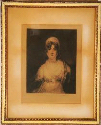
Lot # 160