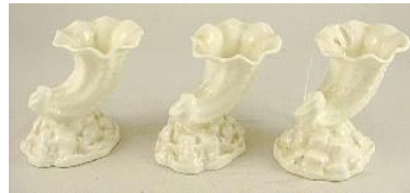
Lot # 11

11 Three Royal Worcester cornucopia spill vases. $50 - $100