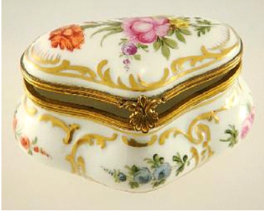
Lot # 291

291 Porcelain box with flowers on the lid.