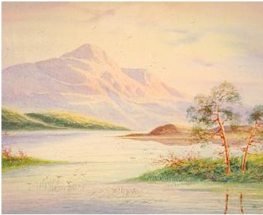
Lot # 288

288 Watercolour signed E.Stanley, 9 in. x 12 1/2 in., "Loch Vennachar".