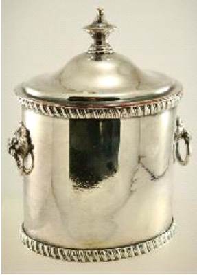
Lot # 15

15 Small Plated canister with attached lid.