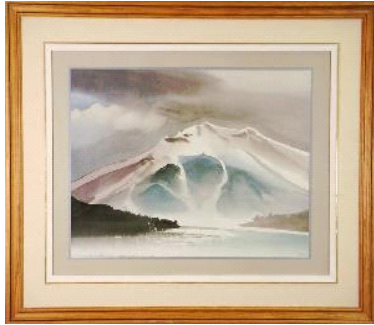
Lot # 26

26 Coloured print signed Onley, "Whistler Mountain over Green Point".