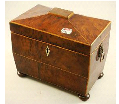
Lot # 311

310 Victorian mahogany what-not table. $50 - $100