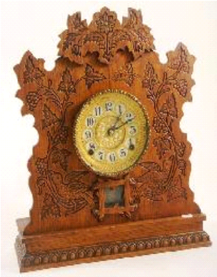
Lot # 151