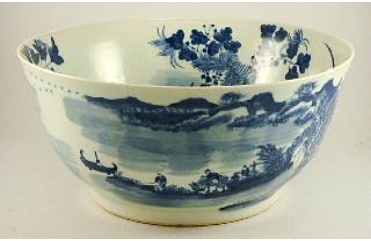
Lot # 294

294 Large blue and white hand painted bowl.