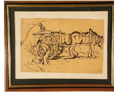
Lot # 304

303 Metal figure of a nude standing man, height 10 1/2 in. $75 - $100