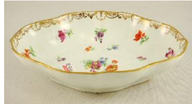
Lot # 9

8 Leather scissor case with scissors. $10 - $15