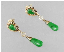
Lot # 463

462 Victorian gold jemstone lapel brooch. $50 - $100