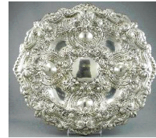
Lot # 413