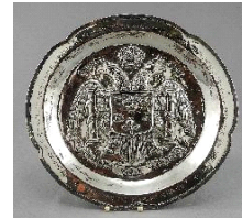
Lot # 417