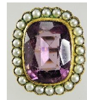
Lot # 427