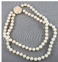
Lot # 438