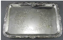
Lot # 405