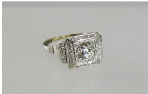
Lot # 422