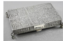
Lot # 612