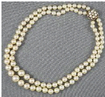
Lot # 433