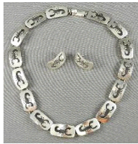
Lot # 537

537 Sterling silver necklace and earrings.