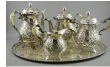
Lot # 416