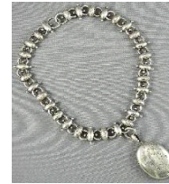
Lot # 440