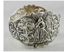
Lot # 597