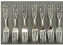
Lot # 420