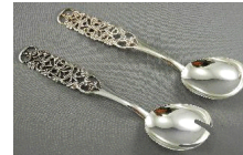
Lot # 442