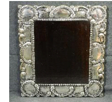
Lot # 415