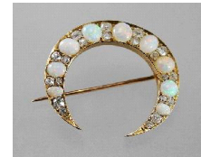
Lot # 426