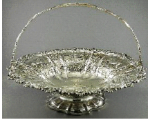
Lot # 402