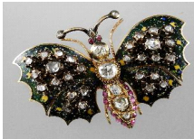
Lot # 421