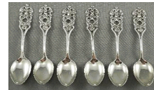
Lot # 443