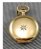
Lot # 694