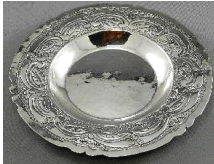
Lot # 419