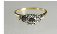
Lot # 428