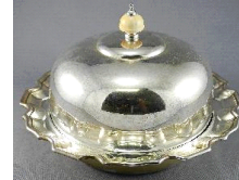
Lot # 441