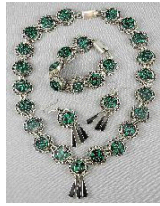
Lot # 535

535 Four piece turquoise and onyx inlaid sterling silver jewelry.