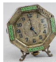
Lot # 693