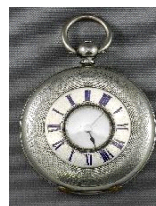
Lot # 692