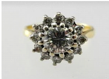
Lot # 423