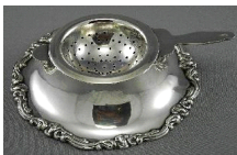
Lot # 508