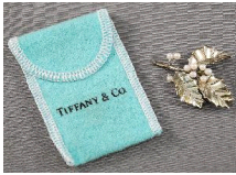
Lot # 430