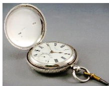
Lot # 685