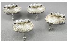
Lot # 449