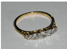
Lot # 420A