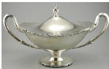
Lot # 410