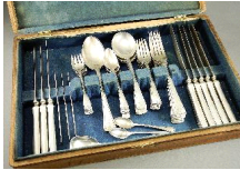
Lot # 442