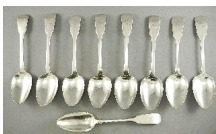
Lot # 423