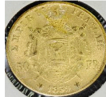
Lot # 452