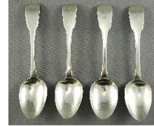
Lot # 585