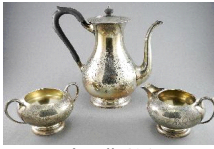
Lot # 401