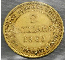
Lot # 457