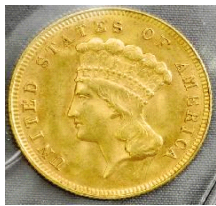
Lot # 459