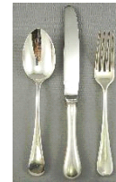
Lot # 587