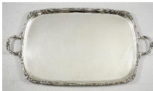
Lot # 443