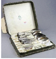
Lot # 559