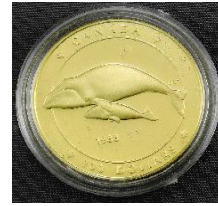
Lot # 451