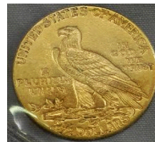
Lot # 455