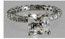
Lot # 411