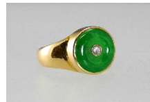
Lot # 431