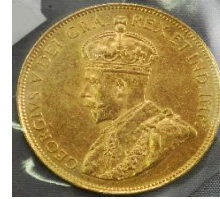
Lot # 462