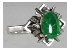
Lot # 501