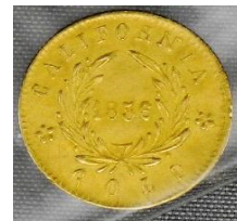
Lot # 453