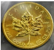
Lot # 460