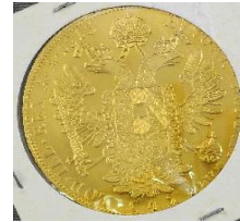
Lot # 461