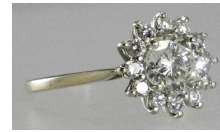
Lot # 413