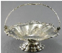
Lot # 405