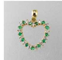
Lot # 541