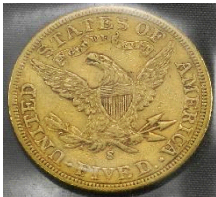
Lot # 458