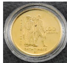
Lot # 454