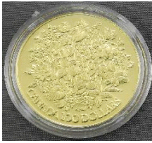
Lot # 456