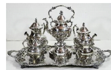
Lot # 467