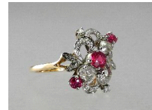
Lot # 417