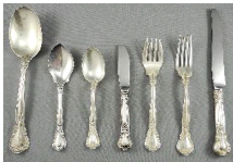
Lot # 516