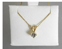
Lot # 434