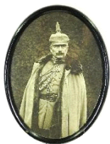
Lot # 431