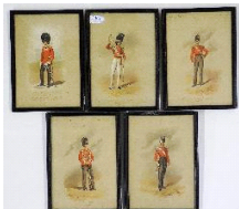
Lot # 433