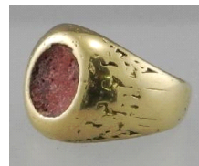
Lot # 459

459 Yellow gold United States Navy graduation ring.