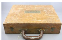
Lot # 414