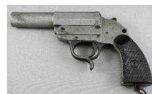
Lot # 420