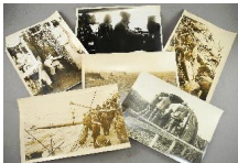
Lot # 472