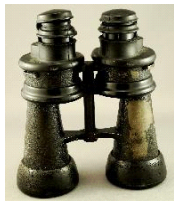
Lot # 450

450 Set of World War II vintage binoculars, length 9 1/4 in.