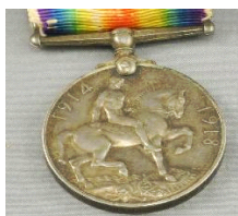
Lot # 456