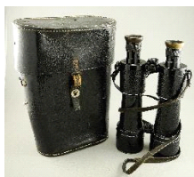
Lot # 451

451 German World War II Zeiss binoculars in a fitted case, length of binoculars 10 1/4 in.