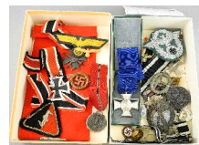
Lot # 461

461 Two boxes of German World War II badges-ribbons and insignia, etc.