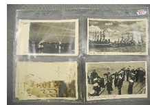
Lot # 418