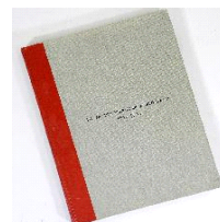
Lot # 466