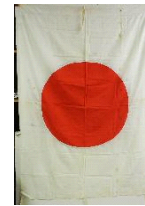
Lot # 481