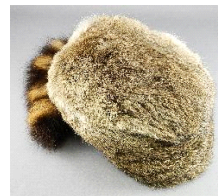
Lot # 439