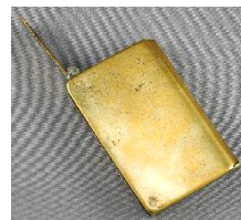
Lot # 416