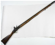
Lot # 497