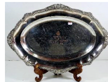
Lot # 441