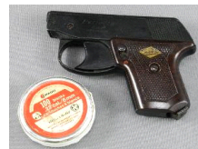
Lot # 422