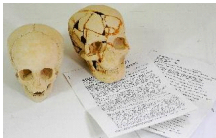
Lot # 476