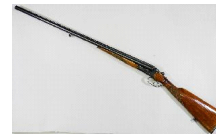
Lot # 487