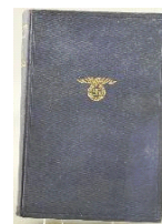
Lot # 417