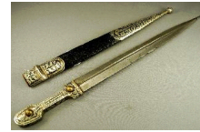
Lot # 502