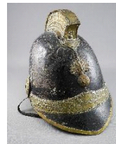
Lot # 438