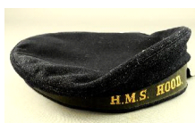
Lot # 453

453 H.M.S.Hood cap tally made in England by Hudson's Bay Company.