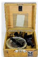
Lot # 402