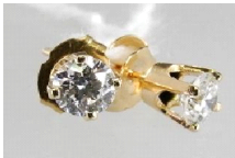
Lot # 539