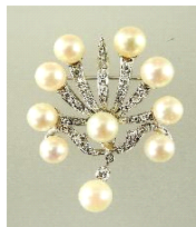
Lot # 433