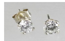
Lot # 560