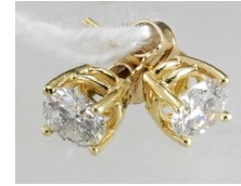
Lot # 551