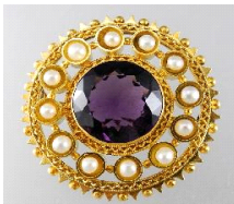
Lot # 479