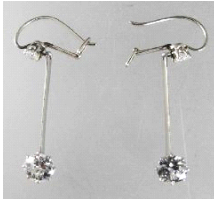
Lot # 411