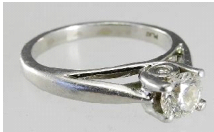
Lot # 476