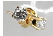
Lot # 520