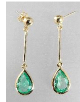
Lot # 492