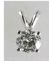
Lot # 559