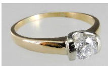
Lot # 435