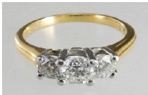
Lot # 453