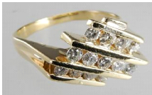
Lot # 540