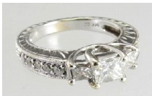
Lot # 456