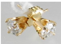
Lot # 518