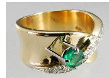
Lot # 533