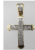
Lot # 459