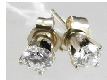
Lot # 531