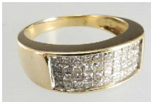
Lot # 538