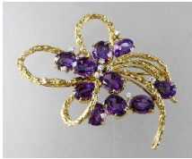
Lot # 451