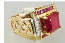
Lot # 558