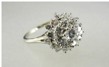
Lot # 477