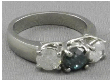
Lot # 534