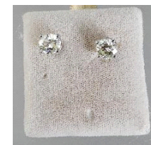
Lot # 438