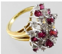
Lot # 432