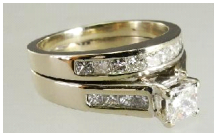
Lot # 455