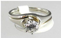
Lot # 514