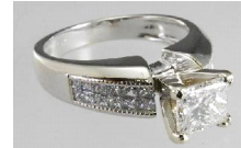
Lot # 418