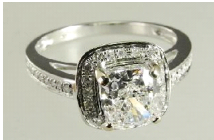
Lot # 414