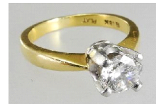
Lot # 437