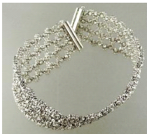
Lot # 478