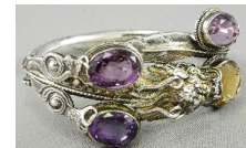
Lot # 596