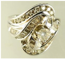
Lot # 474