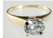
Lot # 415