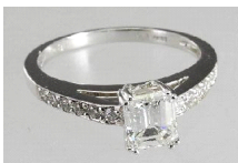
Lot # 457