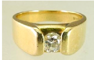
Lot # 52

52 Men's 18k yellow gold and diamond solitaire ring, .40ct VVS-2, G-H col with consignors appraisal.