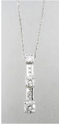
Lot # 44

44 14k white gold and diamond pendant on chain, with consignor's appraisal.