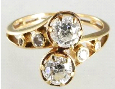
Lot # 94

93 14k white gold and diamond solitaire ring, 1.05 ct. with consignor's appraisal. $1,200 - $1,400