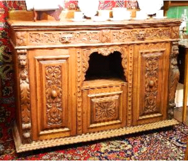
Lot # 149