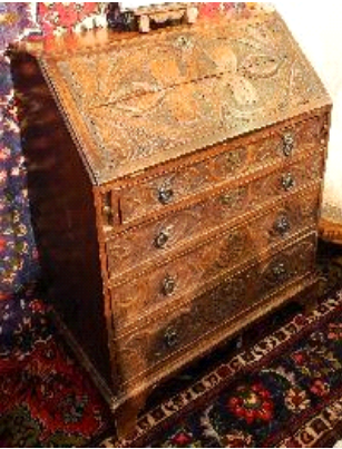
Lot # 206