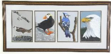
Lot # 141