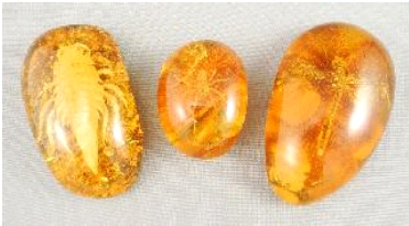
Lot # 73

73 Three amber insect specimens, length 3" and smaller.