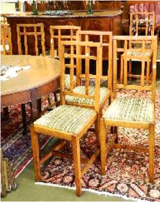
Lot # 164

163 Mid-Victorian mahogany pole screen. $100 - $150