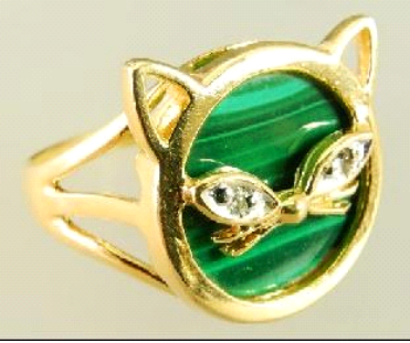
Lot # 92

92 14k yellow gold diamond and malachite cat form ring.