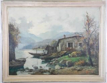
Lot # 215