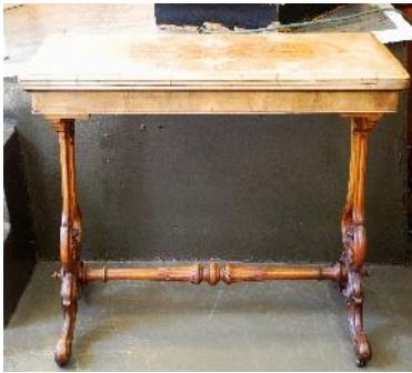
Lot # 228

227 Edwardian inlaid mahogany armchair. $75 - $125