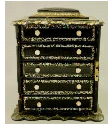
Lot # 260

260 Victorian lacquered jewelry box with mother of pearl decoration, height 7 3/4".