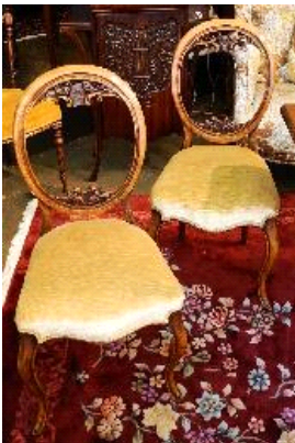
Lot # 224

224 Pair of upholstered balloon back chairs. $100 - $200