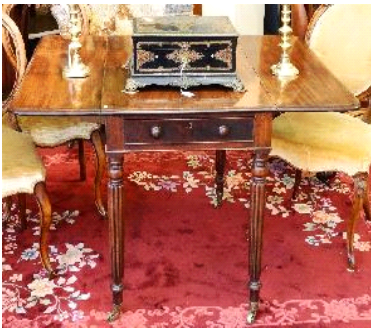
Lot # 222

221 Continental painted terra-cotta figure of a standing young woman with mandolin,ht.19". $100 - $150