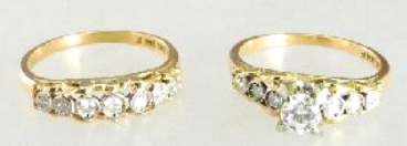
Lot # 43