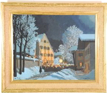
Lot # 267