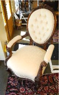
Lot # 230

230 Victorian carved walnut upholstered parlour chair.