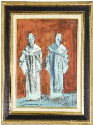
Lot # 238

237 Pair of portrait miniatures signed Childe, 4 1/2" x 3 1/2", "Young Gentleman" & "Young Lady". $150 - $300