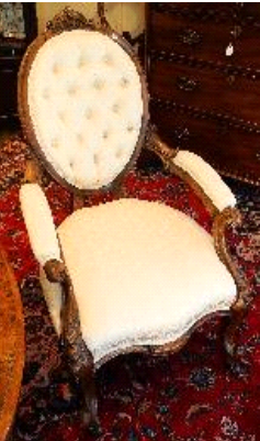
Lot # 236

236 Victorian walnut upholstered parlour chair.