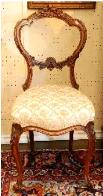
Lot # 239

238 Oil on board signed Henri Masson, 16" x 12", d.1966, "Two Monks". $500 - $700