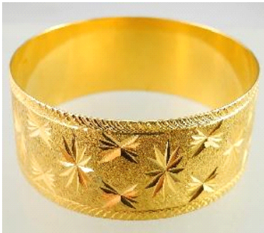
Lot # 95

94 14k yellow gold and diamond cross- over design ring. $600 - $800