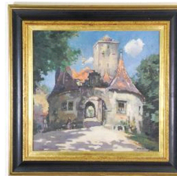
Lot # 257