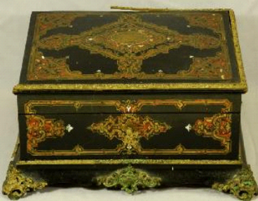
Lot # 220