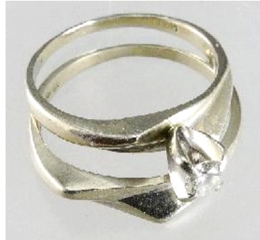
Lot # 50

50 14k white gold and diamond wedding set.