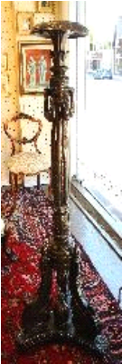
Lot # 235