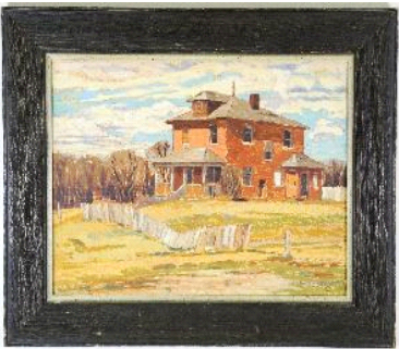
Lot # 37