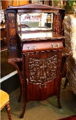
Lot # 214