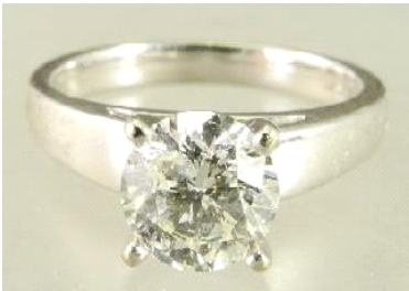
Lot # 93

93 14k white gold and diamond solitaire ring, 1.05 ct. with consignor's appraisal. $1,200 - $1,400