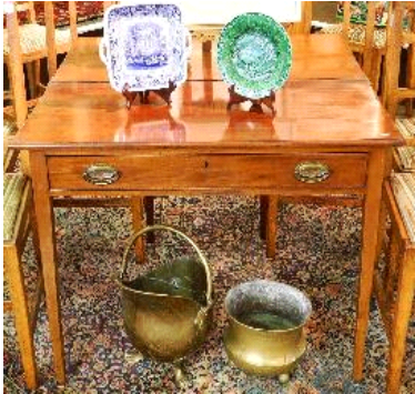
Lot # 167

166 Two 19th century Ironstone plates. $15 - $30