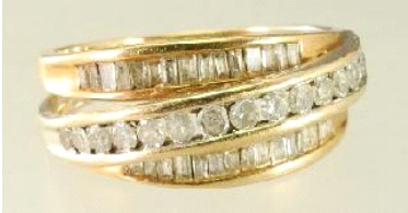
Lot # 54

53 14k yellow gold and diamond combination wedding ring set, with consignor's appraisal. $400 - $500