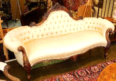
Lot # 274