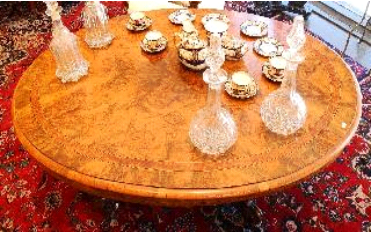
Lot # 273