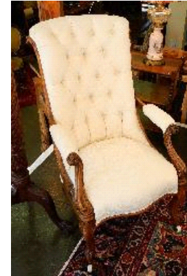
Lot # 252

252 Early Victorian upholstered armchair.