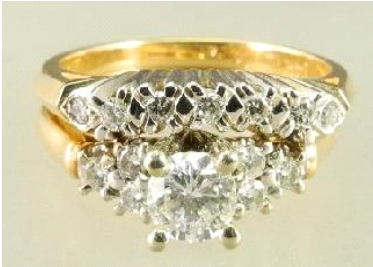
Lot # 53

246 Late Georgian mahogany chest of drawers. $300 - $500 247 Acrylic on masonite signed J.M. Wispinski, 11" x 14", "A Tired Boat". $50 - $100 248 Oil on board s.on back G.Casciaro d. '81, 5 1/2" x 7 1/2", "Landscape w, Figure & Church". $75 - $150 249 Oil on canvas unsigned, d.1885, "Portrait of W.C. Braithwaite". $100 - $150 250 Oil on board signed L.O. 1934, 14 1/2" x 10 1/2", "Goldstream Flats". $50 - $100