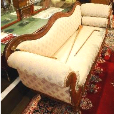
Lot # 171

170 Sheraton-style mahogany side chair. $40 - $60