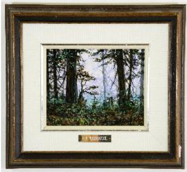
Lot # 154

153 Etching signed Fred A. Farrell, 12" x 9 1/4", "Big Ben & Westminster Bridge from the Thames". $40 - $60