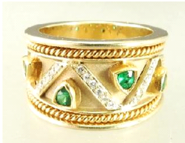
Lot # 45

45 18k yellow gold emerald and diamond ring, with consignor's appraisal.