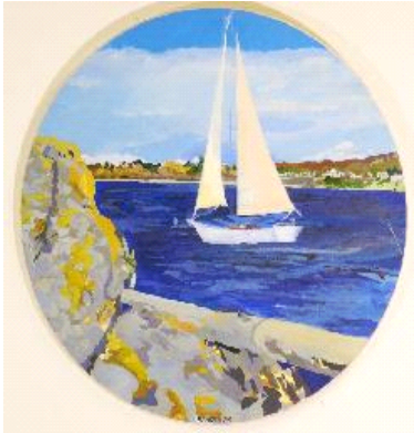
Lot # 181

181 Oil on panel signed Howarth, d.1985, diameter 23", "Dallas Rd. #2". $400 - $600