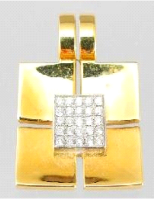
Lot # 42