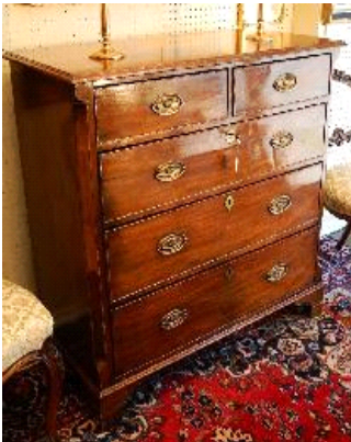
Lot # 246

242 19th. century hunting print and a 19th. century battle print. $10 - $20 243 Oil on canvas signed Macnayr, 14" x 16", "Genoa Bay Marina". $50 - $100 244 Oil on canvas signed Hutton Mitchell 22" x 28", "Winter Near Val Morin- Quebec". $250 - $500 245 Pair of brass candlesticks. $75 - $100