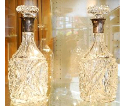
Lot # 259

259 Pair of antique decanters with sterling tops.