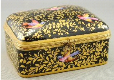
Lot # 1