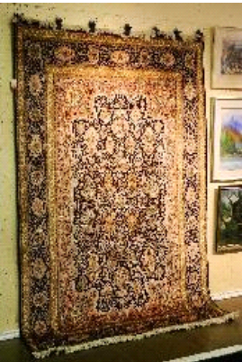
Lot # 275