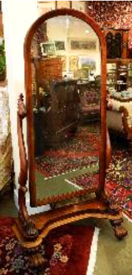
Lot # 217