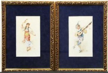
Lot # 268