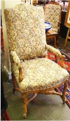
Lot # 70

62 Oil on canvas signed Pamela Scott, 30" x 40", "New Westminster". $150 - $300 63 19th century brass bed frame. $50 - $100 64 Baluchi rug. $50 - $100 65 19th century upholstered rocking chair. $50 - $100 66 Oil on board signed H.A.Fitch dated 1886, 18 in. x 13 1/2 in., "Yellow Roses". $50 - $100 67 Kurdish long rug. $100 - $150 68 Art Nouveau flow blue decorated china chamber basin, dia. 17". $30 - $60 69 Edwardian inlaid mahogany side table. $50 - $100