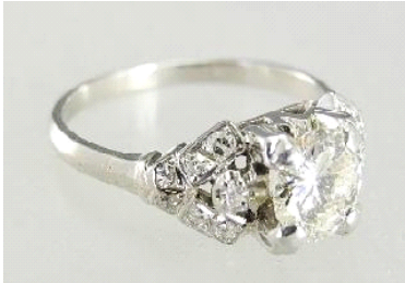
Lot # 96

95 Middle Eastern yellow gold bracelet. $2,000 - $3,000