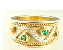
Lot # 458