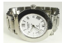
Lot # 590