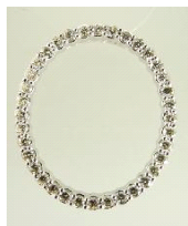
Lot # 575