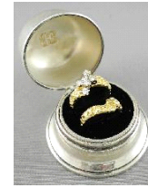
Lot # 515