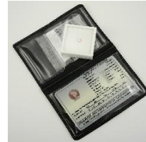
Lot # 483