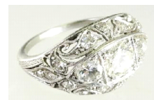
Lot # 415