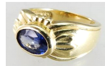
Lot # 580