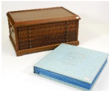
Lot # 536