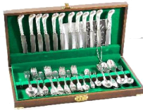
Lot # 403