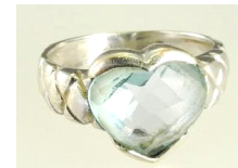
Lot # 521