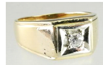
Lot # 487