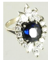
Lot # 428