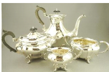
Lot # 423