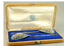
Lot # 417