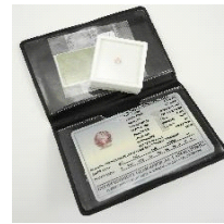
Lot # 482