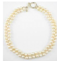
Lot # 455