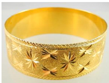
Lot # 445