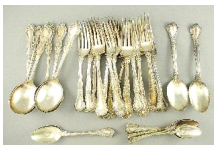
Lot # 479