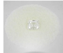
Lot # 412