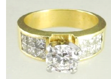
Lot # 411