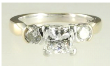
Lot # 441