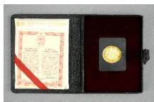
Lot # 571