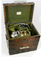
Lot # 401