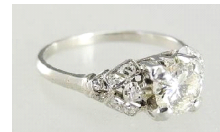
Lot # 413