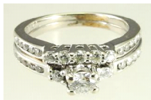
Lot # 577