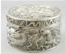
Lot # 402