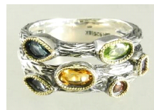
Lot # 456