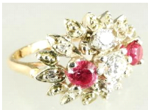
Lot # 432

431 14k 0.75ct diamond solitaire ring SI-1, F-G, VG with consignor's appraisal. $1,600 - $1,800