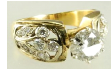
Lot # 411