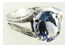
Lot # 457