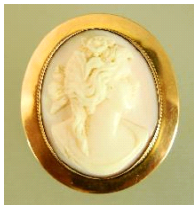
Lot # 495