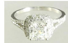
Lot # 415