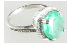
Lot # 437

436 Early 20th century gold ring set seed pearls and red stone. $150 - $250