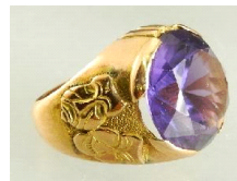
Lot # 460