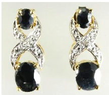
Lot # 455