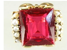
Lot # 436

435 14k yellow gold triangle diamond ring 1.53ct VS2 consignor's appraisal. $4,000 - $6,000