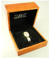
Lot # 467