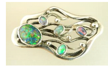
Lot # 476