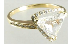
Lot # 435

434 14k gold diamond trinity ring 0.29 TCW with consignor's appraisal. $300 - $500