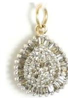
Lot # 513