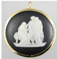
Lot # 583

583 14k yellow gold Wedgwood cameo brooch. $150 - $200