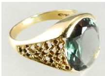
Lot # 473