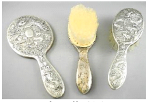
Lot # 401