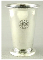
Lot # 404