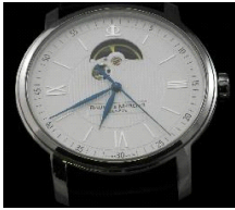
Lot # 466