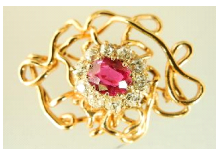
Lot # 452