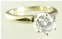
Lot # 431

430 Set of five Birks sterling silver tea spoons. $30 - $60