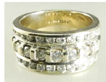
Lot # 458