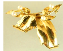
Lot # 478