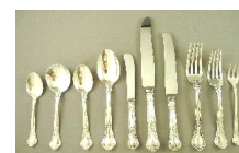
Lot # 481