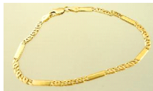
Lot # 560

559 10k yellow gold and hematite ring. $25 - $50