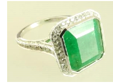
Lot # 411