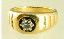
Lot # 418

417 14K White Gold Diamond Trinity ring. $2,000 - $3,000