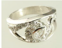
Lot # 459