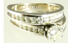
Lot # 453