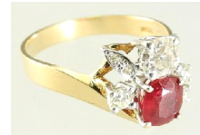
Lot # 454