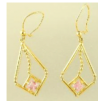
Lot # 554