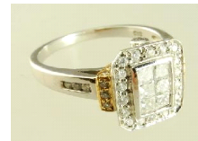
Lot # 457