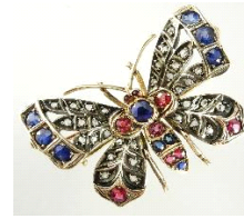
Lot # 452