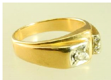
Lot # 497