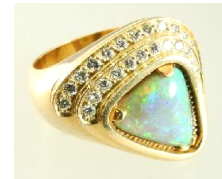
Lot # 413