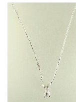
Lot # 476