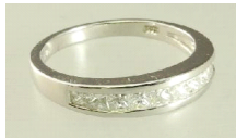
Lot # 460