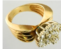
Lot # 432

431 14k yellow gold and amethyst ring and earring set. $400 - $600