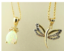
Lot # 537