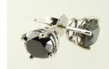
Lot # 473