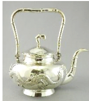
Lot # 405