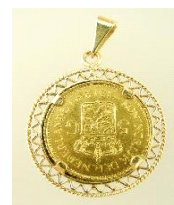
Lot # 780