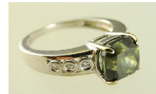
Lot # 455