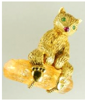
Lot # 419

418 14k yellow gold and diamond ring. $500 - $700