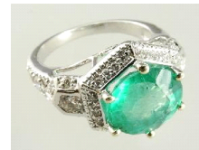
Lot # 456