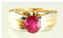
Lot # 493