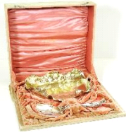
Lot # 401