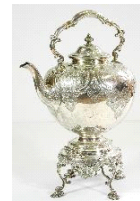
Lot # 503