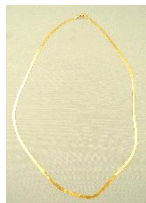
Lot # 538