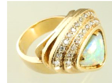
Lot # 412