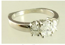
Lot # 417

417 14K White Gold Diamond Trinity ring. $2,000 - $3,000