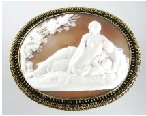
Lot # 439