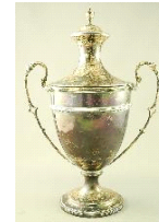
Lot # 430

429 Hallmarked sterling silver pedestal bowl. $50 - $100