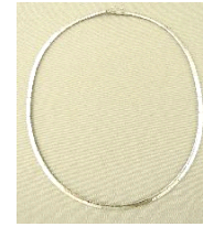
Lot # 472