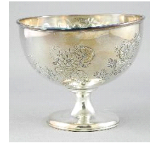
Lot # 426

425 Pair of sterling silver candlesticks. $50 - $100