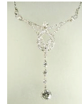
Lot # 414