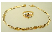
Lot # 572

571 10k yellow gold and synthetic sapphire ring. $40 - $60