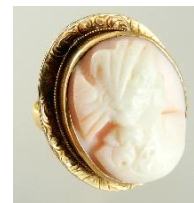
Lot # 515