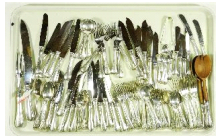
Lot # 423

422 Birks sterling silver cigarette box-The Oakville Club 51/54. $75 - $150