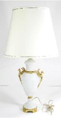
Lot # 263

262 Oil on canvas, signed Tin Yan, 12"x16", "Trawler at Bay". $150 - $200