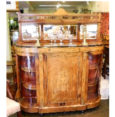
Lot # 298