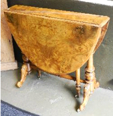
Lot # 258

257 Oak chest in 17th c. style. $200 - $400