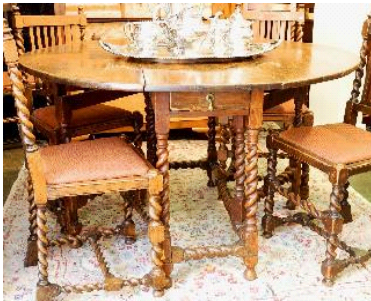
Lot # 253