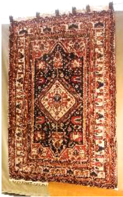
Lot # 246