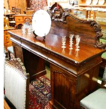
Lot # 200