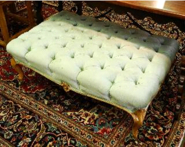
Lot # 93

92 Foilio of 18th & 19th century engravings. $50 - $100