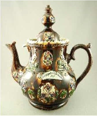
Lot # 286