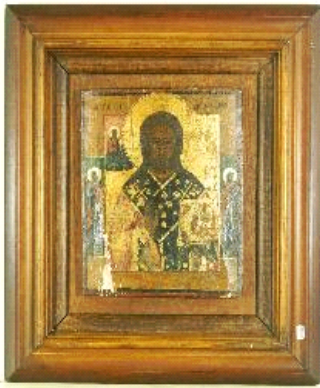
Lot # 267