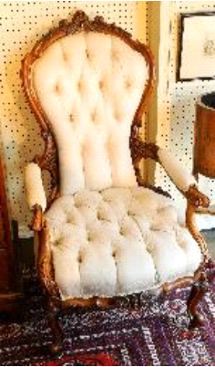
Lot # 281