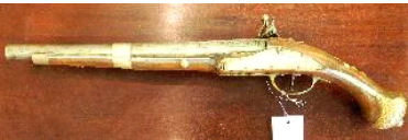
Lot # 171

170 Watercolour possibly signed M. Haselerhave, 13 1/2" x 19", "Harvest Scene". $75 - $150