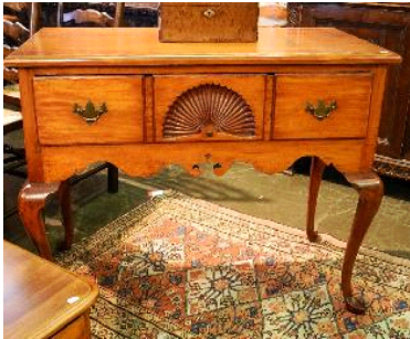
Lot # 225

224 19th. century bird's eye maple sewing box. $50 - $75