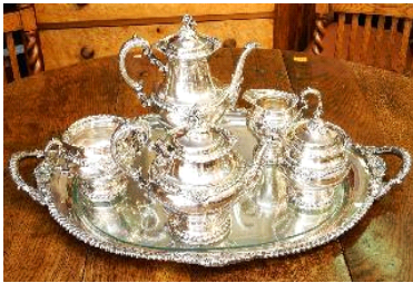
Lot # 251