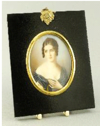
Lot # 271