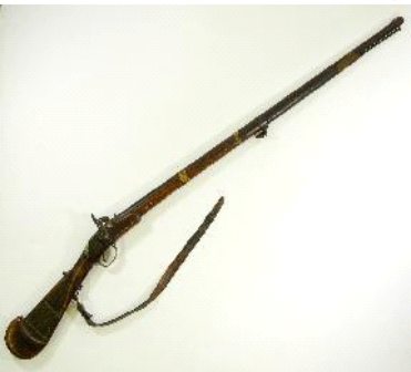
Lot # 173

172 Albanian flintlock pistol with mother of pearl & brass decoration, length 21". $150 - $300