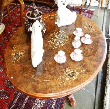
Lot # 285