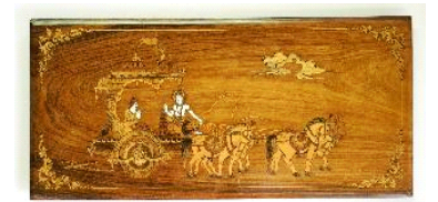
Lot # 297

297 Edwardian bone and marquetry inlaid rosewood table top, 14" x 30".