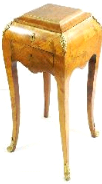
Lot # 289

288 Two Edwardian inlaid Mahogany Side Chairs $150 - $300