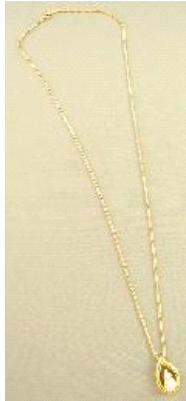
Lot # 2

2 18K yellow gold, diamond and pearl mounted pendant with consignors appraisal.