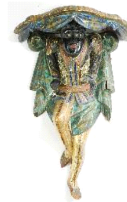
Lot # 294

294 Carved wooden polychrome decorated "Blackamoor" wall bracket, length 20".