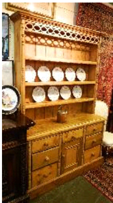
Lot # 165