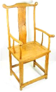
Lot # 71