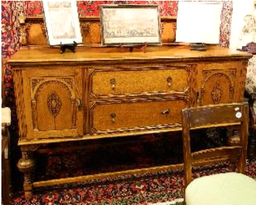
Lot # 33