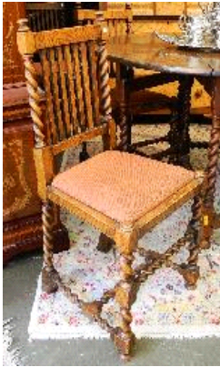
Lot # 252