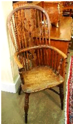
Lot # 218

217 Watercolour signed A.E. Prangley, 5" x 8", "Aferglow on the Dent du Midi". $200 - $400