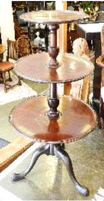
Lot # 260

259 15th century carved pinewood figure of a male Saint, 30 1/2". $250 - $500