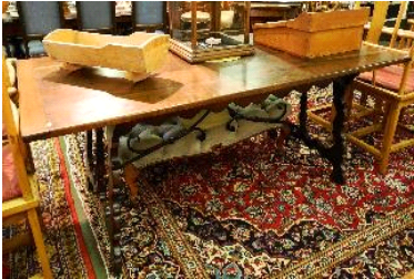
Lot # 79

78 Quebecois pine doll's crib. $15 - $30