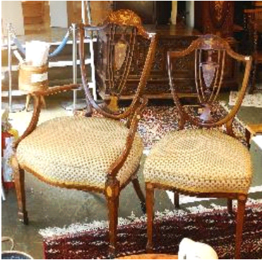
Lot # 288

288 Two Edwardian inlaid Mahogany Side Chairs $150 - $300