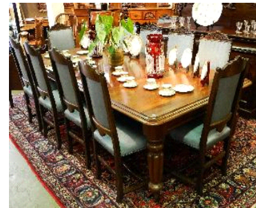
Lot # 205