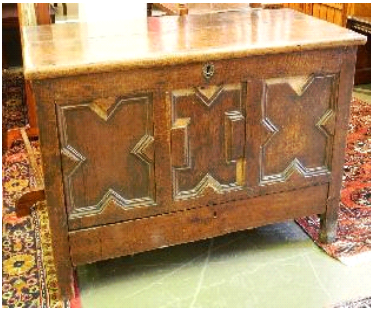
Lot # 66