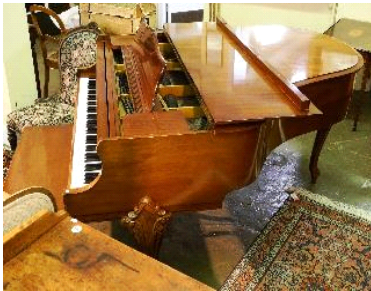
Lot # 77