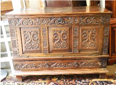
Lot # 257

256 Baluchi rug with pictoral hunting design dated 1367. $100 - $200