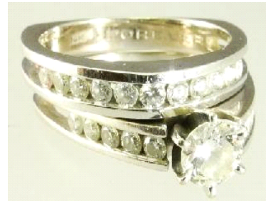
Lot # 4

4 14k white gold and diamond combination wedding band set, with consignor's appraisal.