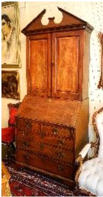
Lot # 293

292 19th century continental Burl walnut writing table w/ ormolu mounts. $200 - $400