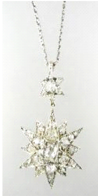
Lot # 3

3 Platinum & diamond star burst pendant necklace.