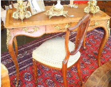
Lot # 292

291 Louis XVI gilt bronze bevelled mirror. $150 - $200