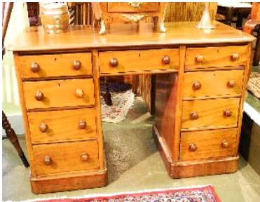
Lot # 222

222 Victorian mahogany writing desk. $150 - $250