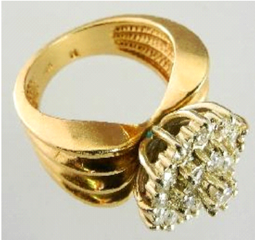
Lot # 7

293 George III mahogany secretaire bookcase. $400 - $600