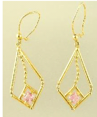
Lot # 5

5 Pair of 18k yellow gold and pink topaz earrings.