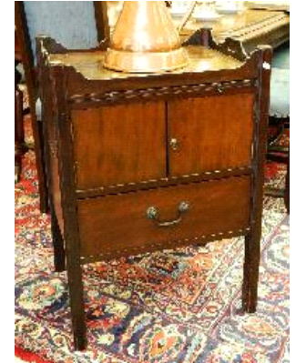
Lot # 209