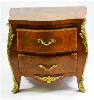
Lot # 220

219 Oak biscuit jar with plated top, mounts and handle. $25 - $50