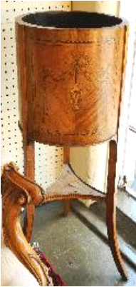
Lot # 280