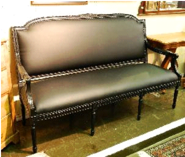
Lot # 111