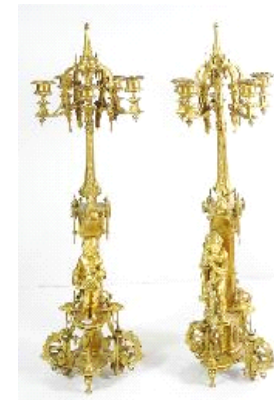
Lot # 295

295 Pair of Gothic revival gilt metal figured candelabra, overall height 26".