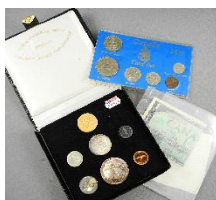
Lot # 661