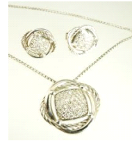
Lot # 577