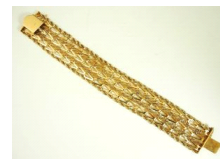
Lot # 430