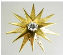
Lot # 423