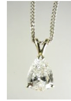
Lot # 406