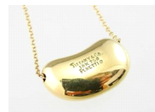
Lot # 429