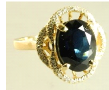
Lot # 446

445 14k yellow gold hinged bracelet, with consignors appraisal. $750 - $1,250