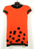
Lot # 403