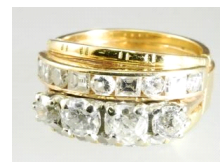
Lot # 425