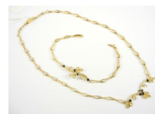
Lot # 732