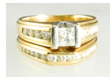
Lot # 424