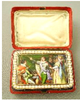
Lot # 401