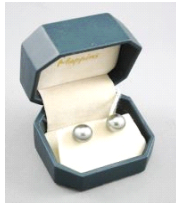
Lot # 559