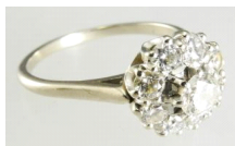
Lot # 443

442 14k yellow gold diamond ring with 0.80tcw and consignors appraisal. $400 - $600