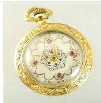
Lot # 485