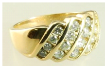
Lot # 442

441 14k yellow gold Qulin statue mounted with garnets -rubies -jade & sapphires,w consig.appr. $4,000 - $5,000