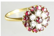
Lot # 571