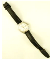
Lot # 487