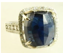
Lot # 422