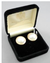
Lot # 464

463 14k yellow gold and diamond solitaire ring. $400 - $600