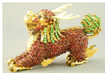
Lot # 441

440 Large English hallmarked silver pedestal serving basket. $300 - $500