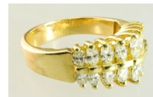
Lot # 449

448 Tacori 18k white gold yellow diamond engagement ring, 0.87ct with GIA cert and cons. appraisal. $3,000 - $4,000