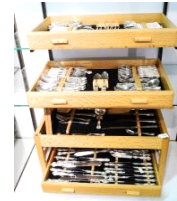
Lot # 409