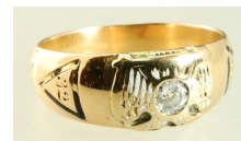
Lot # 724