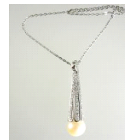
Lot # 450

449 18k yellow gold marquise diamond ring, with consignors appraisal. $750 - $1,000