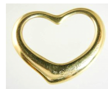
Lot # 427