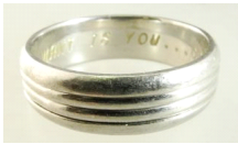
Lot # 734