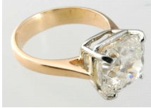
Lot # 402