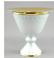
Lot # 411