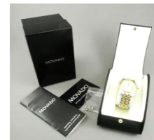
Lot # 503