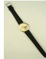
Lot # 501