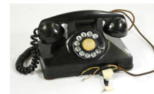
Lot # 423