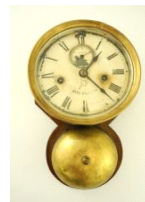
Lot # 416