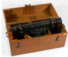
Lot # 402