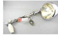
Lot # 437