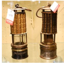
Lot # 429