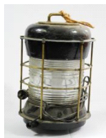
Lot # 410