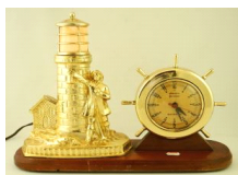
Lot # 506

506 Lighthouse mantel clock by Gibraltar Precision.