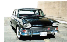
Lot # 450