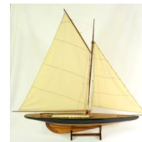
Lot # 419