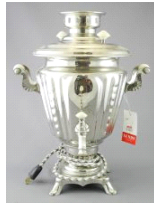
Lot # 455