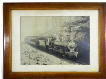
Lot # 407