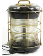
Lot # 428