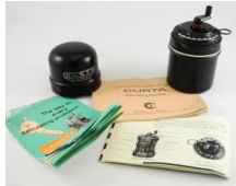
Lot # 430