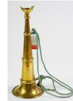
Lot # 414