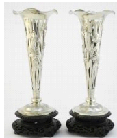
Lot # 470