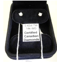
Lot # 591