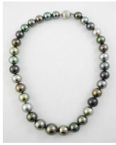
Lot # 490