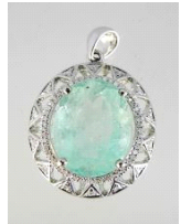
Lot # 492