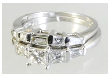
Lot # 500