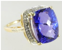
Lot # 494