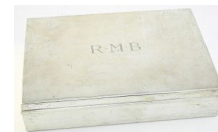
Lot # 448