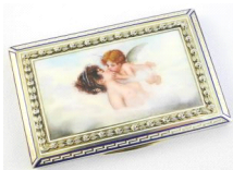
Lot # 411