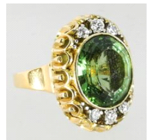
Lot # 429