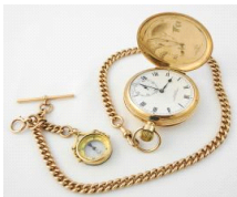
Lot # 617