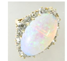
Lot # 423