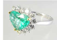
Lot # 419