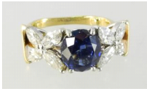
Lot # 452