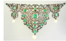
Lot # 461