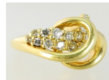
Lot # 425