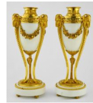
Lot # 440