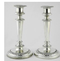
Lot # 447