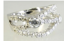
Lot # 552