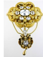
Lot # 483