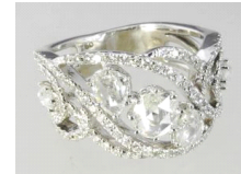
Lot # 485