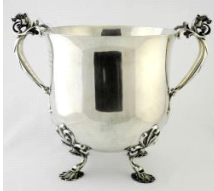
Lot # 469