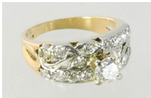
Lot # 456