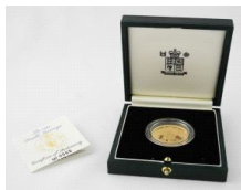
Lot # 682