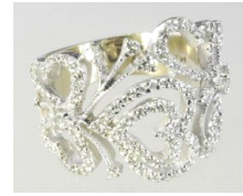
Lot # 551