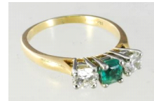
Lot # 463