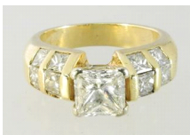
Lot # 428