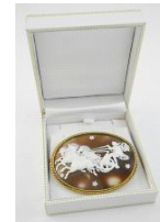
Lot # 465