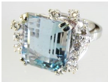
Lot # 427