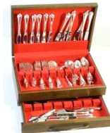
Lot # 669