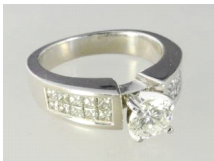
Lot # 454