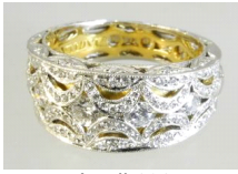
Lot # 606