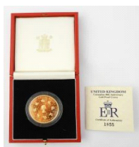
Lot # 681