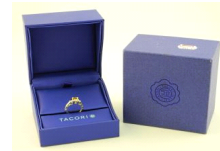
Lot # 418