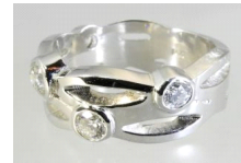
Lot # 594