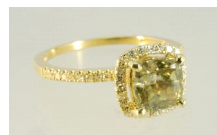
Lot # 459