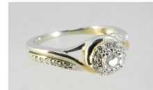
Lot # 425