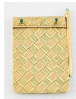
Lot # 457