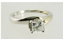
Lot # 451