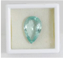
Lot # 531

531 15.47ct loose natural Aquamarine. $500 - $750