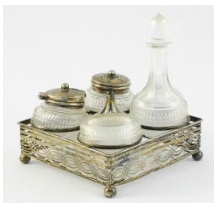
Lot # 608