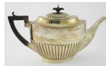
Lot # 441