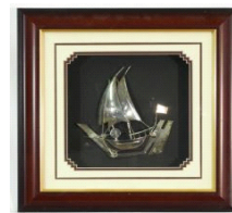
Lot # 437