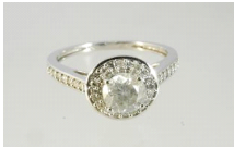
Lot # 426