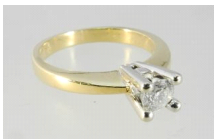
Lot # 430