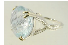
Lot # 484

484 14K White Gold 19.20ct Aquamarine and Diamond ring.