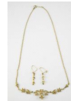
Lot # 553

552 Sterling silver 7 x 5mm genuine garnet tennis bracelet, 22 garnets (19 cts), with appraisal. $250 - $275