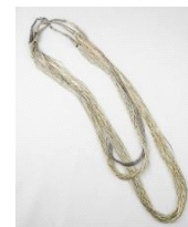
Lot # 591