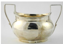
Lot # 432