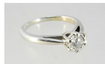
Lot # 458