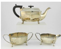
Lot # 449