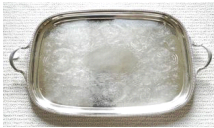
Lot # 468