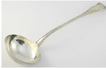
Lot # 410