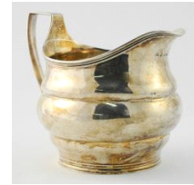
Lot # 435