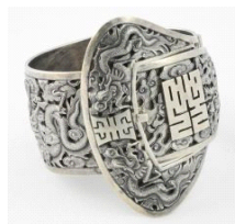
Lot # 452