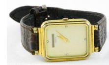
Lot # 662