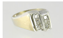
Lot # 455