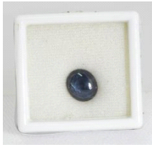
Lot # 558