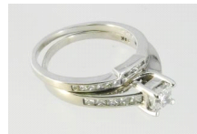
Lot # 460