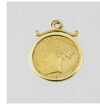
Lot # 482

482 Gold Sovereign 1870 in pendant clasp.