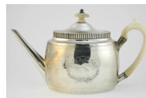
Lot # 439