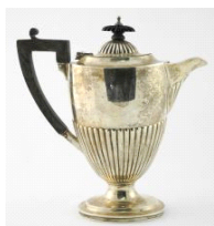
Lot # 448