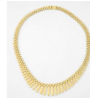
Lot # 486

486 European 18k gold Egyptian revival necklace with appraisal.