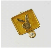
Lot # 487