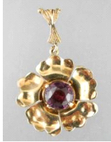
Lot # 488