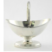
Lot # 416