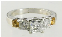
Lot # 429