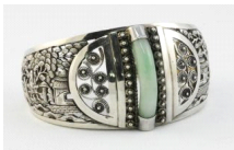
Lot # 532

531 15.47ct loose natural Aquamarine. $500 - $750