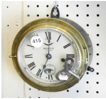
Lot # 415