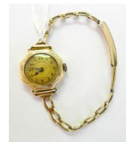
Lot # 511