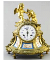
Lot # 427