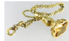
Lot # 512