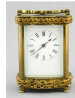
Lot # 429