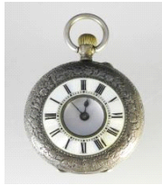
Lot # 520