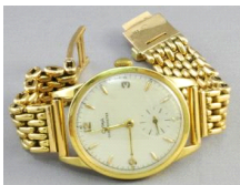
Lot # 422