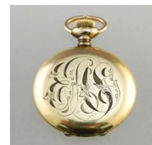
Lot # 518