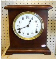
Lot # 416