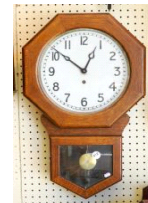
Lot # 412