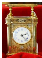
Lot # 437