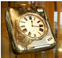
Lot # 404