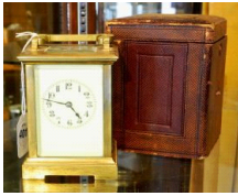
Lot # 401