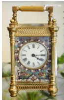
Lot # 403