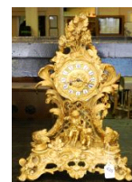
Lot # 435