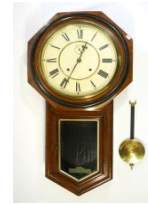
Lot # 409