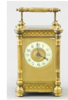
Lot # 424