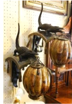
Lot # 719