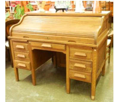
Lot # 652