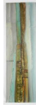
Lot # 432