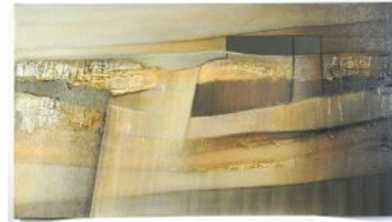
Lot # 489