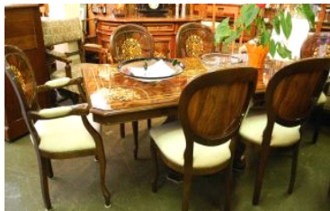
Lot # 656