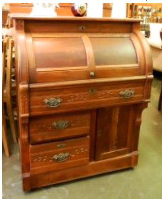
Lot # 660