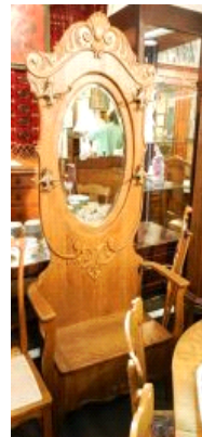
Lot # 693