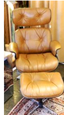
Lot # 736