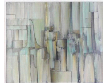
Lot # 596