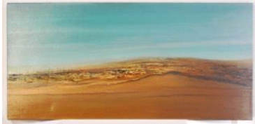
Lot # 568