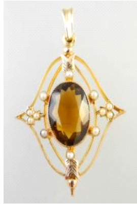
Lot # 577