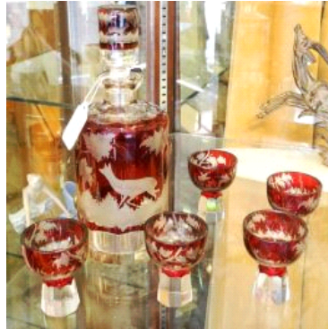
Lot # 711