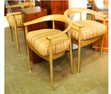
Lot # 497