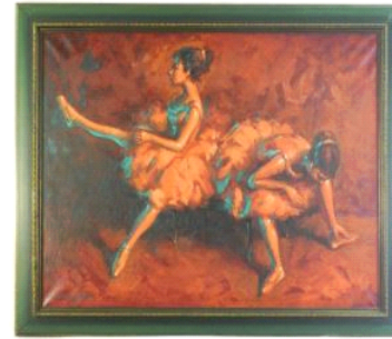
Lot # 677