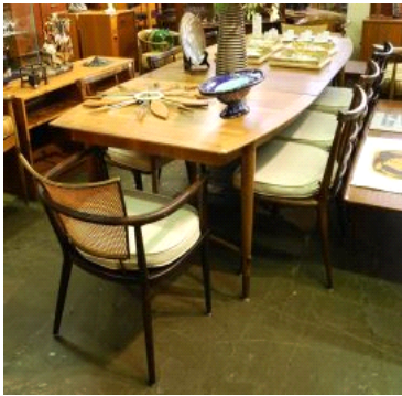
Lot # 519