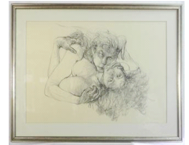
Lot # 554

553 Lithograph after Alberto Giacomette, "Seated Woman". $20 - $30