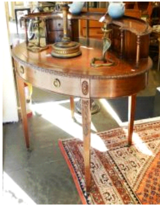
Lot # 734