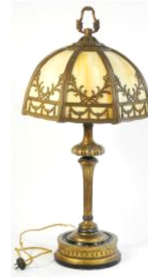
Lot # 735