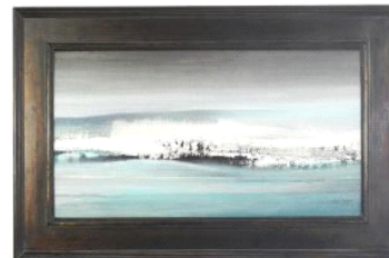
Lot # 588