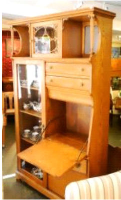
Lot # 703