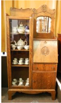
Lot # 691

691 Oak mirrored back bureau/display cabinet.