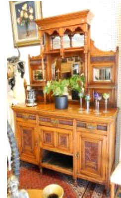
Lot # 722