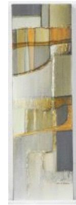
Lot # 724