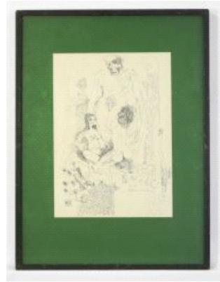
Lot # 692

692 Ink drawing signed (Claude) Breeze d.'64, 13" x 10 1/2", "Lovers in a Landscape #3".