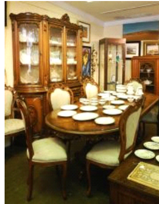
Lot # 621