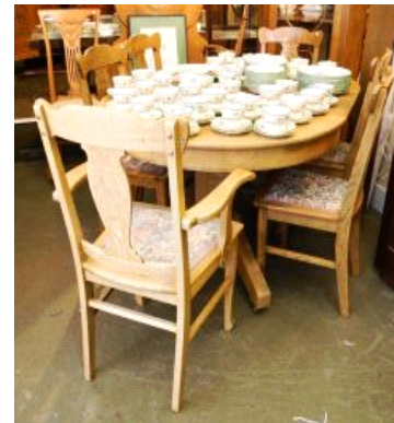
Lot # 697