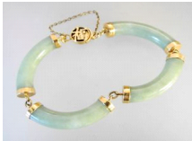
Lot # 420