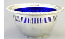
Lot # 426