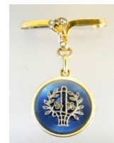
Lot # 417