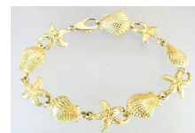
Lot # 452