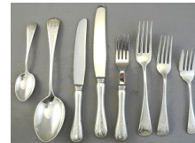
Lot # 446