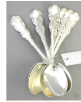
Lot # 425