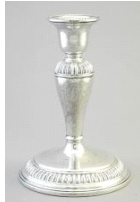
Lot # 402