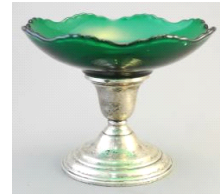
Lot # 442