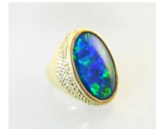
Lot # 416