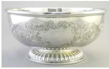
Lot # 401