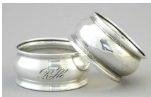
Lot # 405