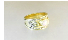
Lot # 412