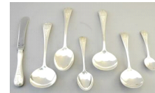
Lot # 429