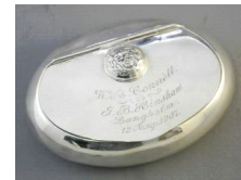
Lot # 427