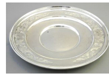
Lot # 445