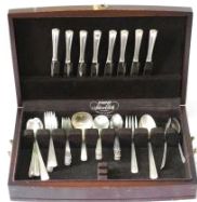
Lot # 423