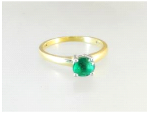
Lot # 418