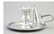
Lot # 495