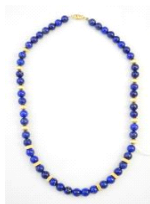
Lot # 440