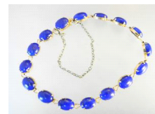
Lot # 451