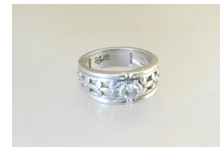
Lot # 413