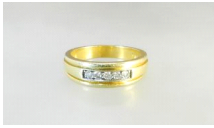
Lot # 434