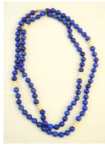
Lot # 419