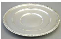
Lot # 441