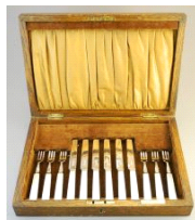
Lot # 473