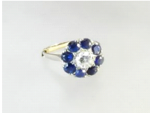
Lot # 435