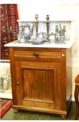
Lot # 32