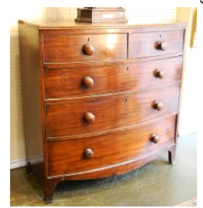
Lot # 243

243 Victorian mahogany bow front chest of drawers. $150 - $250