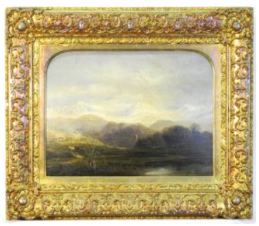
Lot # 239 239 Unsigned oil on board, 11 1/2" x 16 1/2", "Country with Horses". $50 - $100