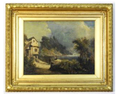
Lot # 231 231 Unsigned oil on canvas, 9 3/4" x 13 1/2", "Lake Fishing".