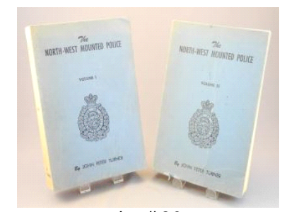
Lot # 26