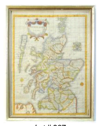
Lot # 237 $40 - $60 237 Framed map of Scotland by Robt. Morden, 18" x 14".