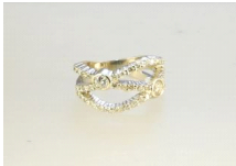
Lot # 436

436 14K gold and diamond bead style right hand ring, 1.21 TCW.