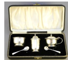
Lot # 449

449 Hallmarked silver 5 piece condiment set in case.