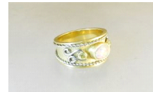
Lot # 414