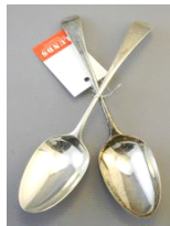
Lot # 409