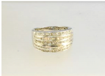
Lot # 456