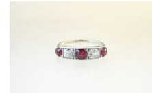
Lot # 431