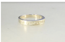
Lot # 438

438 19K Princess cut diamond Anniversary ring with woven edge.