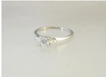
Lot # 419