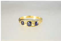
Lot # 454