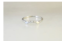
Lot # 506