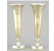
Lot # 425