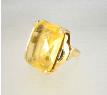
Lot # 453