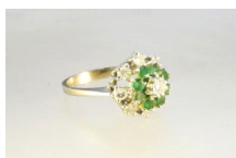
Lot # 480