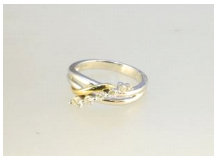
Lot # 437

437 14K gold graduated diamond set Journey ring, .33 TCW.