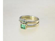
Lot # 413