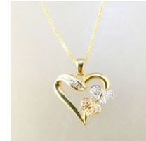
Lot # 459