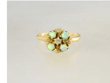
Lot # 433