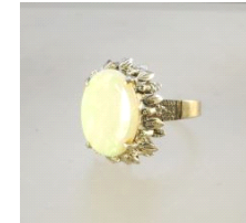
Lot # 432