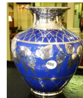
Lot # 465