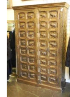
Lot # 429