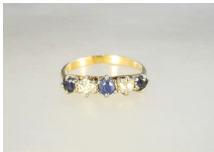
Lot # 457