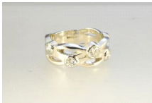
Lot # 435

435 14K woven style diamond set right hand ring, 0.69 TCW