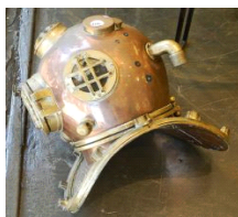
Lot # 486