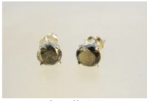
Lot # 418