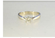
Lot # 412