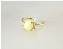
Lot # 420