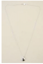
Lot # 452