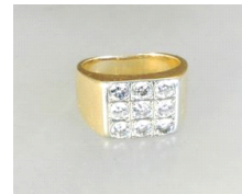
Lot # 415