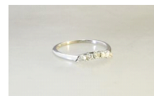
Lot # 501