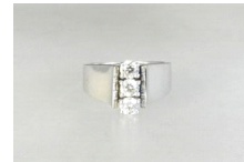
Lot # 417