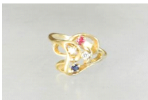
Lot # 439