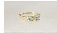
Lot # 458