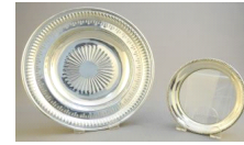
Lot # 427