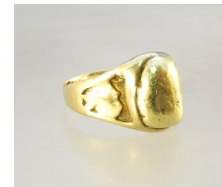
Lot # 460