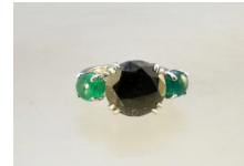
Lot # 416