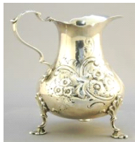
Lot # 404