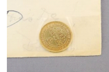
Lot # 461