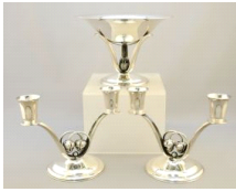
Lot # 471