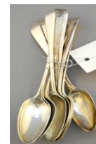
Lot # 534