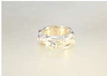
Lot # 418