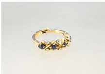
Lot # 419