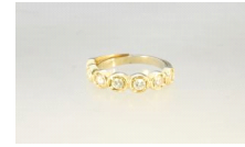
Lot # 483