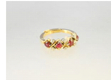
Lot # 420