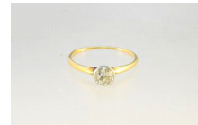
Lot # 451