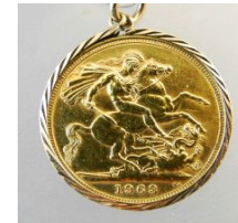
Lot # 439