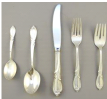
Lot # 502

502 International sterling silver flatware- approx.17 pieces,etc.