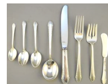
Lot # 497