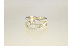
Lot # 484