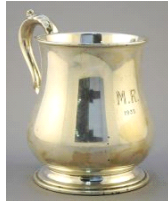
Lot # 403