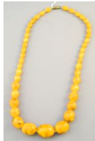
Lot # 433