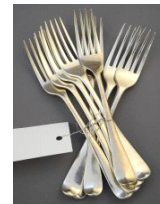
Lot # 425