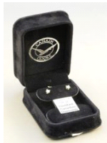
Lot # 437