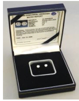
Lot # 415