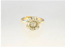
Lot # 416