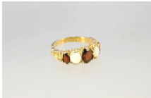
Lot # 453