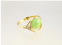
Lot # 459