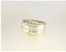
Lot # 452