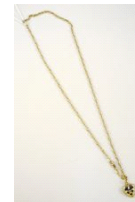
Lot # 412