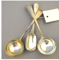
Lot # 538