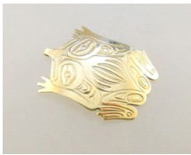
Lot # 434