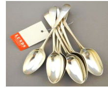
Lot # 409