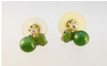
Lot # 458