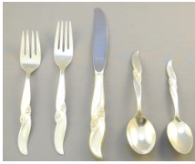
Lot # 431