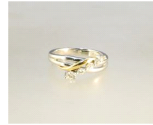
Lot # 438