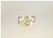
Lot # 457