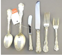
Lot # 539