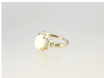
Lot # 482