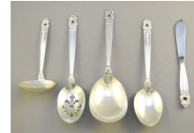
Lot # 410