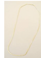
Lot # 468