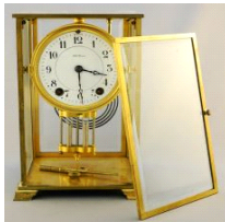
Lot # 422