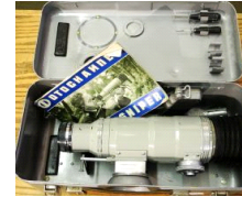
Lot # 439