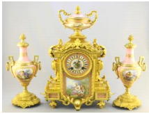
Lot # 401