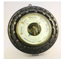
Lot # 412