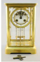
Lot # 419