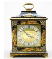
Lot # 413