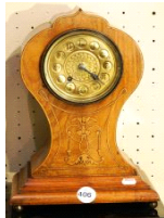
Lot # 406