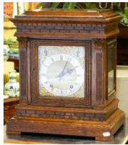
Lot # 421