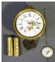
Lot # 408