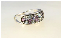
Lot # 98