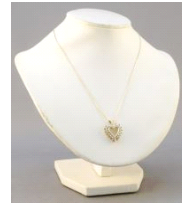
Lot # 151