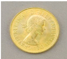
Lot # 192