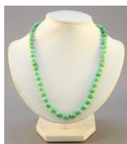
Lot # 171