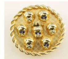
Lot # 79