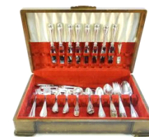
Lot # 21