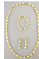
Lot # 80