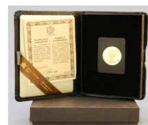
Lot # 204