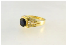
Lot # 71