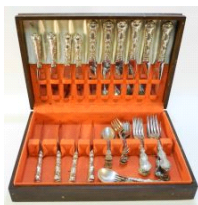
Lot # 106