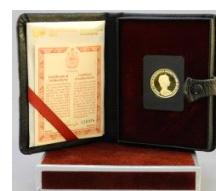
Lot # 186