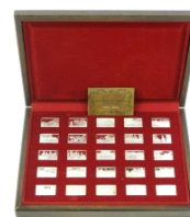
Lot # 66