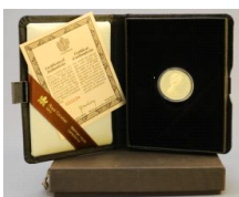
Lot # 194