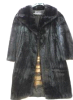
Lot # 23