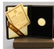
Lot # 203