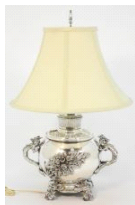
Lot # 50