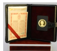
Lot # 187