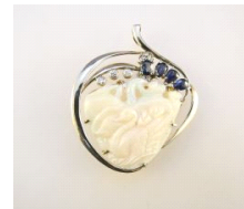
Lot # 40