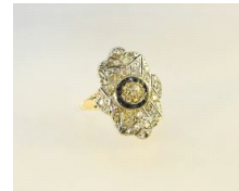
Lot # 20