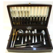
Lot # 46