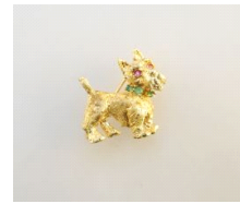
Lot # 38