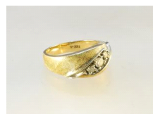
Lot # 59