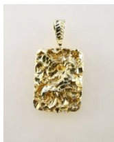
Lot # 36