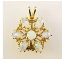
Lot # 73