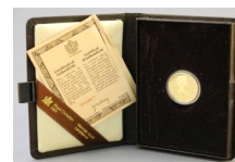
Lot # 185