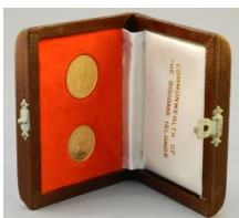
Lot # 193