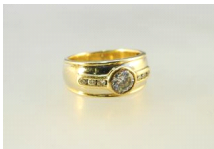
Lot # 72