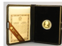
Lot # 184