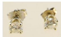
Lot # 58