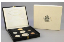
Lot # 195