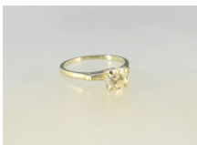
Lot # 56