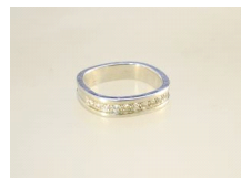
Lot # 57