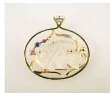
Lot # 60