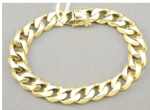
Lot # 34