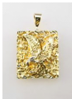
Lot # 35