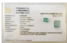
Lot # 76