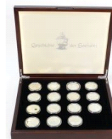
Lot # 336