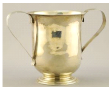
Lot # 109