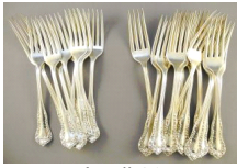
Lot # 30