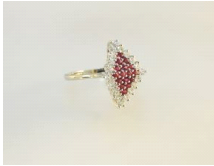
Lot # 54