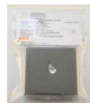
Lot # 127