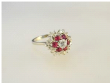
Lot # 32