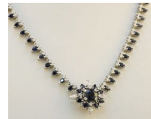
Lot # 51