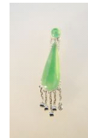
Lot # 52