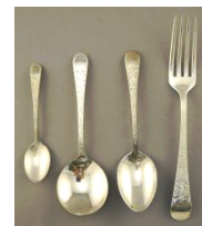
Lot # 205