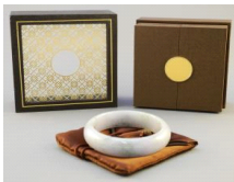
Lot # 242

241 Group of Rhinestone & Faceted Jet Jewellery: Necklace, Bracelet, Earrings & Buckle. $60 - $100