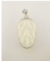
Lot # 56