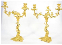
Lot # 1