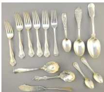
Lot # 252

251 Antique Muff Chain with Seed Pearl Slider, not gold. $50 - $75