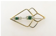
Lot # 33