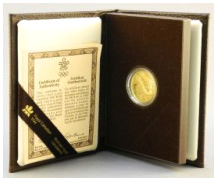
Lot # 57