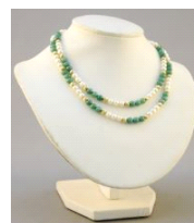
Lot # 120