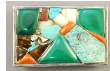
Lot # 330