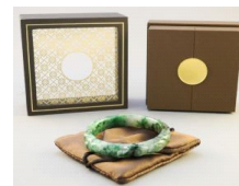
Lot # 225