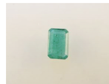
Lot # 237