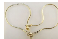
Lot # 73