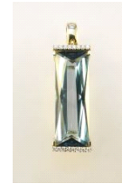
Lot # 60