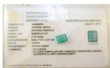
Lot # 117