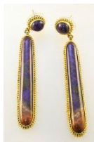
Lot # 15