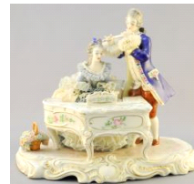
Lot # 297

297 MZ Irish Dresden "Magic Flute" Figurural Group, 8 3/4" x 9" x 6 1/4".