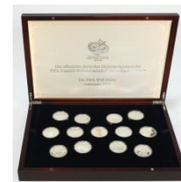
Lot # 335