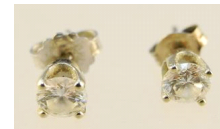
Lot # 71