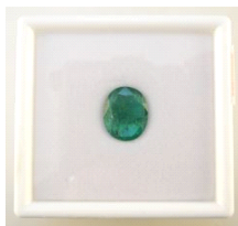
Lot # 148