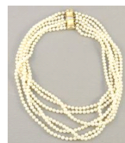
Lot # 93