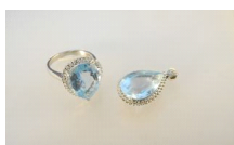
Lot # 113