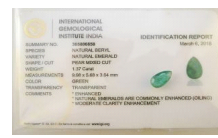
Lot # 92