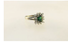
Lot # 39