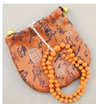
Lot # 209