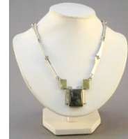
Lot # 19