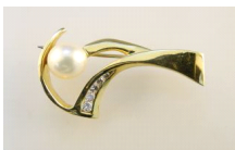
Lot # 37