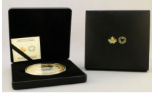
Lot # 339