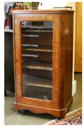
Lot # 307

307 Victorian Walnut Music Cabinet, 37 1/2" High. $150 - $300