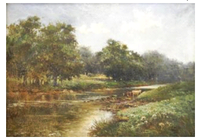
Lot # 108

108 Oil on Canvas Signed L. Morris, 11 1/2" x 17 1/4", "Cows Watering".