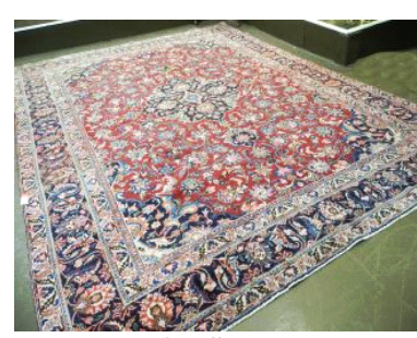
Lot # 277

277 Khorasan Carpet, Approximately 12'7" x 9'7". $600 - $900