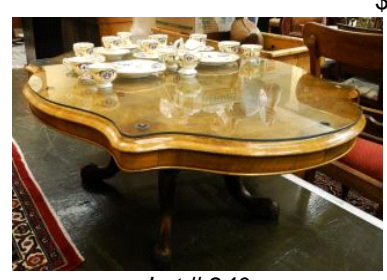
Lot # 240

239 Edwardian Inlaid Oval Mahogany Tray, 25 1/4". $80 - $100