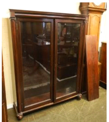
Lot # 204

204 Mahogany Ionic Column Double Door Bookcase, 55 1/4" High.