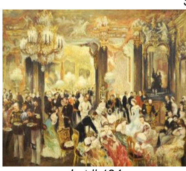
Lot # 184