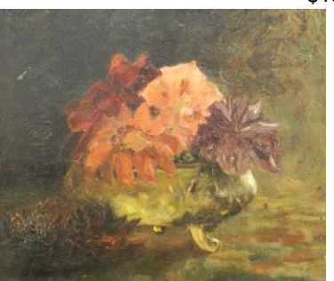
Lot # 233

233 Oil on Board Signed L.(Louis) Remy, 10 1/2" x 14 1/8", "Still Life".