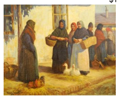
Lot # 242

242 Unidentified Oil on Canvas, 23 1/4" x 31", European School/ Village Scene.