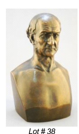
38 Bronze Bust of Gladstone Signed T. (Thomas) Woolner 1882, 8 7/8" High.