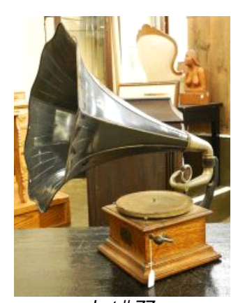
Lot # 77

77 Victor 1 Phonograph, "Talking Machine", 26" Length.