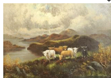
Lot # 118