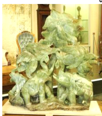
Lot # 301

301 20th Century Very Large Translucent Green Hardstone Sculpture Depicting Elephants, Approx.36"H.