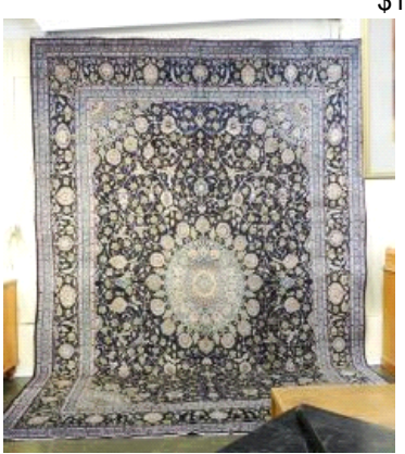
Lot # 111

111 Kashmir Carpet, Approximately 12'10" x 9'6". $400 - $600