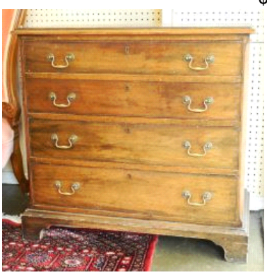
Lot # 271

271 Georgian-Style Mahogany 4 Drawer Chest, 19 7/8" High.