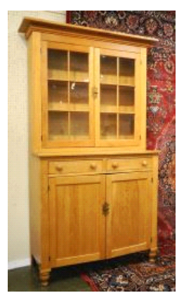
Lot # 237

237 Antique Canadiana Pine China Cabinet 84" High. $150 - $300