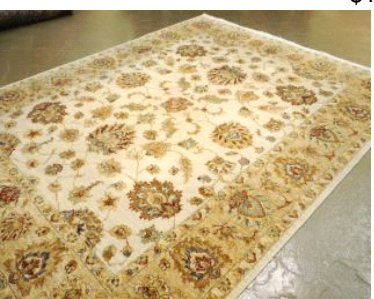
Lot # 89

88 Victorian Burled Walnut Games Table, 28" High. $150 - $300