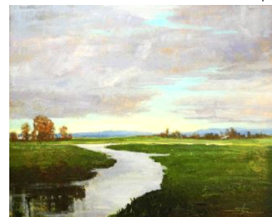
Lot # 42

42 Acrylic on Canvas Signed (Dianna) Shyne, 30" x 40", "Clearing".