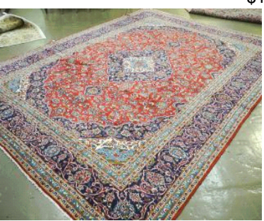
Lot # 290

290 Kashan Carpet, Approximately 12'9" x 9'8". $800 - $1,200