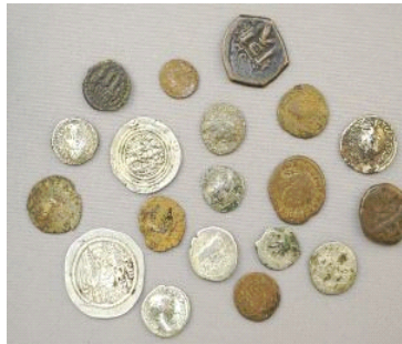
Lot # 133

133 Collection of Ancient Coins: Titus/ Sasanian/ Various.