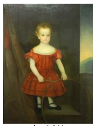
Lot # 300

300 Unsigned Oil on Canvas, 42" x 34", Untitled-Portrait of a Child.