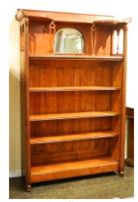
Lot # 222

222 19th Century Cherry Bookshelf Inset with Mirror. 61" x 40" x 13 1/2".