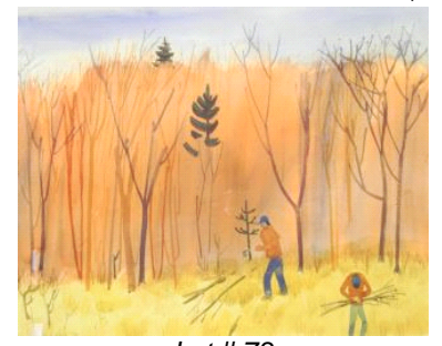
Lot # 78