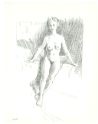
Lot # 305 305 Pencil Drawing signed Zorn, 8" x 6 1/2", "Seated Nude".