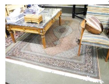
Lot # 157

156 Small Oak Drop Side Gateleg Table, 24" Wide. $60 - $100