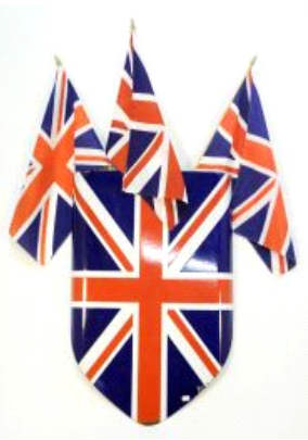
Lot # 173

173 1939 Royal Visit Porcelain Enamel Union Jack Shield.