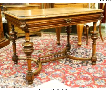
Lot # 269