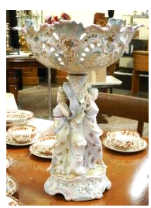
Lot # 275

275 European Porcelain Figural Center Bowl (2 Sections), Damage Noted, 18 3/8" x 14 3/4".