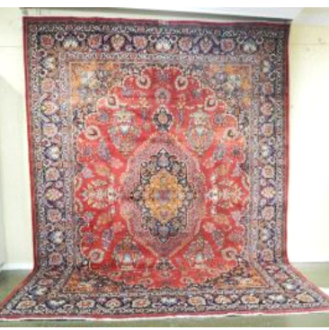
Lot # 235

235 Khorasan Carpet, Approximately 12'8" x 9'9". $1,000 - $1,500