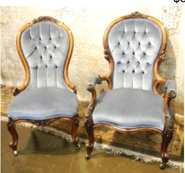
Lot # 299