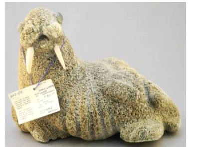
Lot # 137 137 Whalebone Walrus with Eskimo Tag: Mike Kotagigo/ Lake Harbour, 7 1/2" x 12" x 7 1/2".