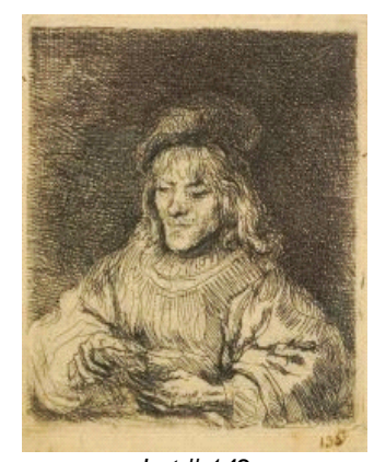
Lot # 142 142 Etching After Rembrandt, 3 7/8" x 3 1/2", "The Card Player".