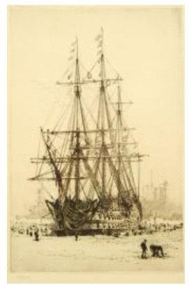
Lot # 45 45 Etching Signed W.L. Wyllie, 14 5/8" x 10 1/2", Untitled- Tall Masted Vessel. $150 - $250