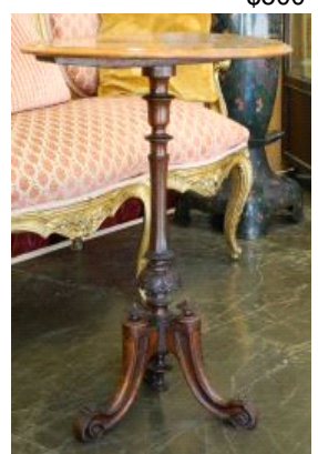
Lot # 19 19 Victorian Burr Walnut Tripod Table with Ebonised & String Inlay, 29 1/4" High.