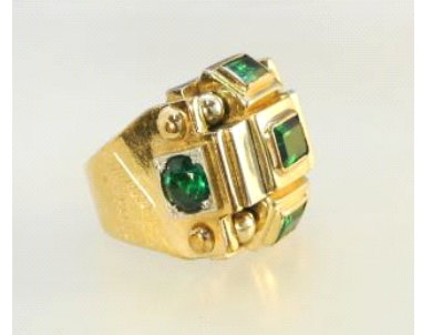
Lot # 33 33 14K & Platinum Ring with Synthetic Spinel Signed Paris, France. $1,200 - $1,700