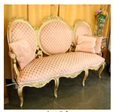
Lot # 3 3 Louis XV Gilt Wood Triple Cameo Back Settee, 70" Length.