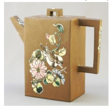
Lot # 58 58 Enamelled Yixing Ware Teapot (6"H), Impressed Mark Under Lid. $150 - $300