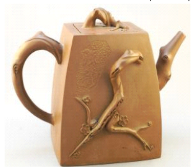
Lot # 54 54 Large Yixing Ware Teapot, 7 1/2" x 6 1/2" x 9 1/4".