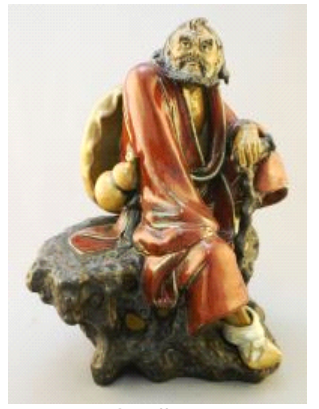
Lot # 68 68 Langyao Glazed Shiwan Ware Figure of Kong Zhi, 10 1/2" High.