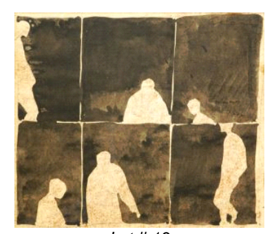
Lot # 13 13 Ink on Paper Signed Ciccimarra, 7" x 9", "6 Figures". $300 - $400