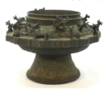
Lot # 120 120 Burmese Bronze Covered Vessel, 8 1/2" x 13" Diameter.