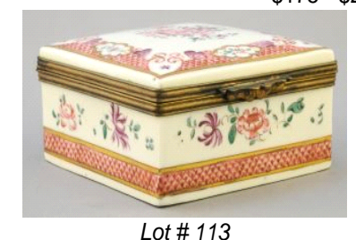
113 Porcelain Hinged Box, 2 1/4" x 4 1/4" x 4 1/4".