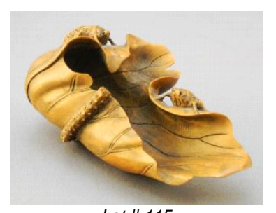
Lot # 115 115 Japanese Carved Wood Naturalistic Okimono, 4" Length, Unsigned.