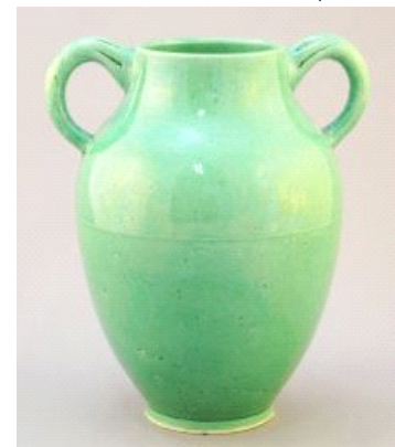
Lot # 56 56 Chinese Green Glazed Porcelain Handled Vase with Impressed Kangxi Mark, 6" High.