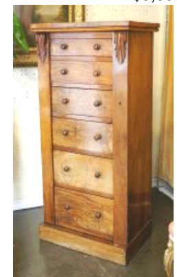
Lot # 163 163 Wellington Chest of Drawers, 42" High.