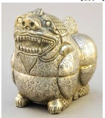
Lot # 109 109 South East Asian Zoomorphic Betel Nut Box, 3 1/2" Length.