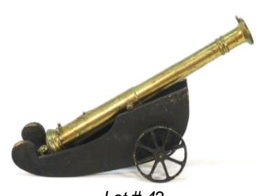
Lot # 42 42 Burmese Bronze Cannon on Carriage, 21 3/4" Length.