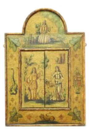
Lot # 99 17th C.-Style Oil on Linen Wall Hanging, Opens to Reveal Mirror, 20" x 15" x 1 1/2".