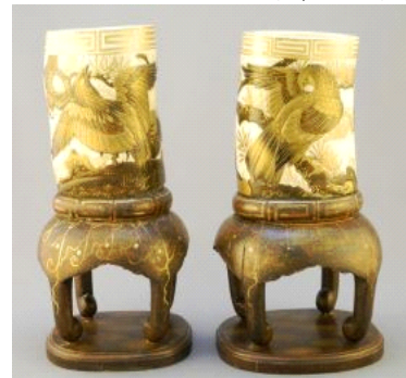
Lot # 25 25 Pair of Japanese Hiramaki-e Tusk Sections on Stands, 8" High, No Export.