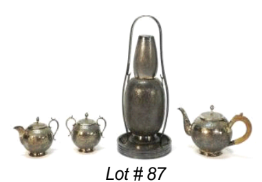
87 Indian Silver Plated Ice Water Pitcher (16 1/4") & 3 Piece Tea Set.