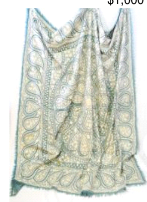
Lot # 41 19th Century Indian Silk Embroidered/ Wool Shawl, 60" x 59", As Found. $100 - $150