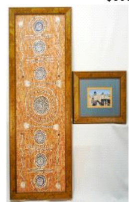
Lot # 50

50 Acrylic on Canvas Signed Ingrid Driver Verso, 49" x 15 3/8", "Grand- fathers Dreaming", with Ph