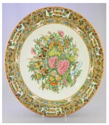
Lot # 77 77 Chinese Cantonese Enamel Porcelain Dish, 15 3/4" Diameter.