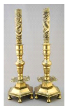
Lot # 126 126 Pair of Antique Hexagonal Bronze Candlesticks, 10" x 5 3/8" x 5 3/8", TW:3305 Grams.