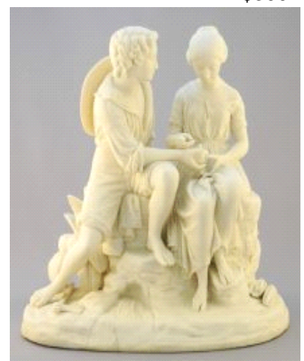
Lot # 105 105 Copeland Parian Figural Group, "Paul & Virginia", 11 1/8" x 6 1/8", Front Hairline & Index Fin $200 - $300