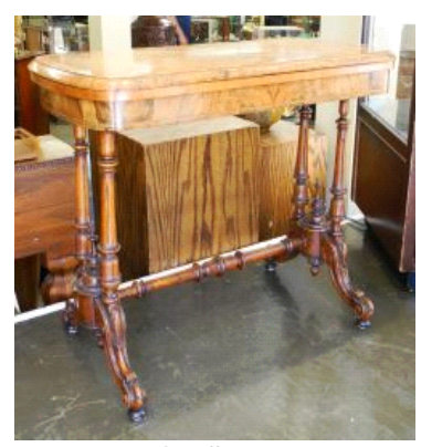
Lot # 164 164 Mid-Victorian Burl Walnut Fold Over Games Table, 28" x 36 1/2" x 18 1/8" $300 - $500