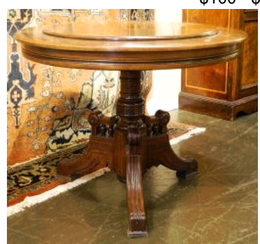
Lot # 66