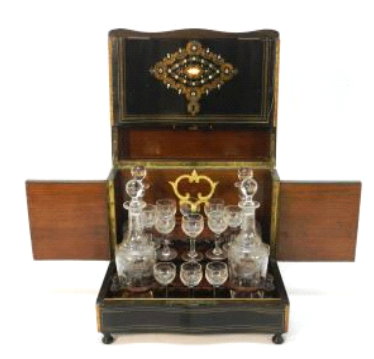
Lot # 138 138 Brass & Mother of Pearl Inset Brass Bonded Walnut Tantalus, 10 1/2" x 12 7/8" x 9 1/2", Loose Br $200 - $300