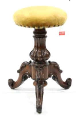
Lot # 154 154 Rosewood Organ Stool, 19 1/2" High. $100 - $200