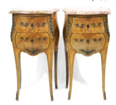
Lot # 17 17 Pair of Marble Top Marquetry Side Tables, 29" High.