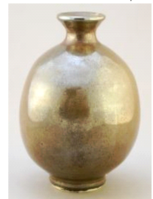
Lot # 86 86 Porcelain Vase Signed with Impressed Mark of Wayne Ngan, 5 7/8" High. $200 - $300