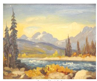
Lot # 136 136 Oil on Board Signed R.(Roland) Gissing, 9" x 12", Untitled- Bow River Scene, Small Losses.