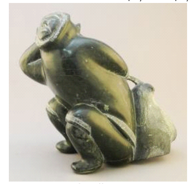
Lot # 72 72 Inuit Stone Carving with Carving No. Label 309-982, 8 1/4 x 9 x 5 1/4", Hunter Pulling Walrus $150 - $300