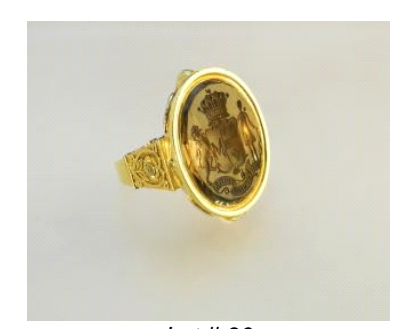
Lot # 36 36 18K (Tested) Yellow Gold & Intaglio Seal Ring, "Nisi Dominus Frustra", Size 7 1/2", TW:29.14 Gram $1,600 - $2,000