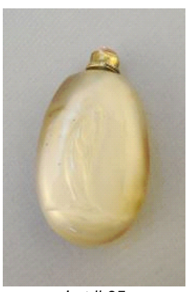
Lot # 95 95 Agate Pebble Snuff Bottle with RubyStyle Stopper, 2" High.