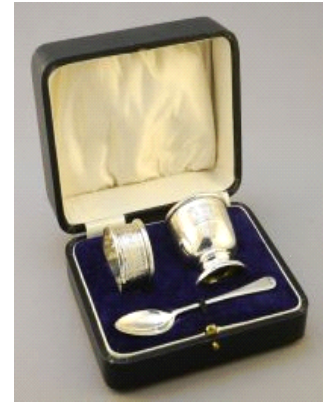
Lot # 111 111 Hallmarked Silver Christening Set Birmingham, "Anne - 1929". $150 - $250