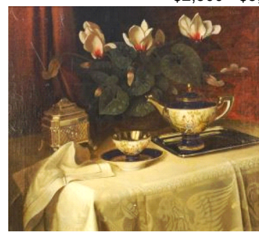
Lot # 124 124 Oil on Canvas Signed Ignaz Schonbrunner '36, 15 1/4" x 18 1/4", "Still Life".