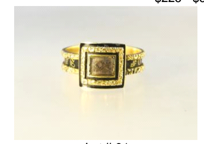
Lot # 31 31 Geo IV 18K Yellow Gold & Enamel Mourning Ring, Dedicated 1826, Size 10 3/4", TW:5.15 Gram $400 - $600