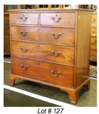
127 19th Century 5 Drawer Mahogany Chest, 40 1/2" x 43" x 21".