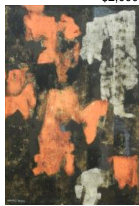
Lot # 5 5 Oil on Board Signed Maxwell Bates, 24" x 20", Untitled/ Abstract with Red. $1,000 - $1,500