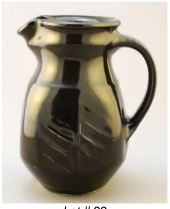
Lot # 22 22 Black Glazed Porcelain Pitcher with Impressed Mark of Wayne Ngan, 7"H. $360 - $500