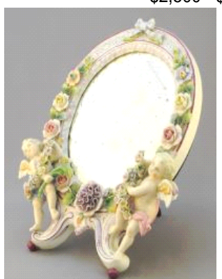
Lot # 143 143 European Porcelain Figural Dresser Mirror, 12" x 8 3/4" x 2 3/8", Chips & De-silvering Noted.