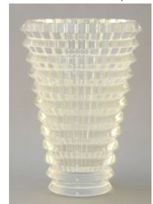
Lot # 78 78 Baccarat Crystal Vase, 5 5/8" High. $100 - $200