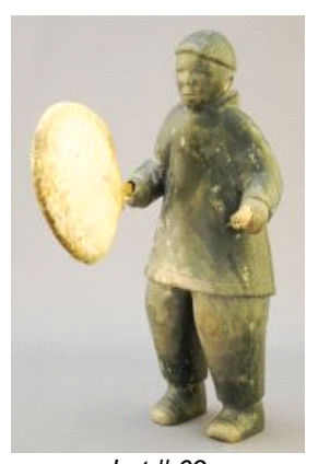
Lot # 69 69 Inuit Stone "Drum Dancer" Signed Edith Aklok, 6 3/8" High