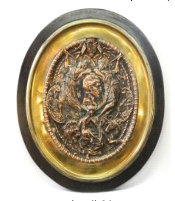
Lot # 90 90 Copper, Brass & Dark Wood Wall Plaque Commemorating The Death of Wellington, 14 1/2" x 13".