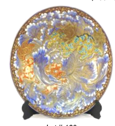
Lot # 160 160 Molded Japanese Porcelain Imari "Shishi" Charger, 23 1/4" Diameter, Restoration Noted.