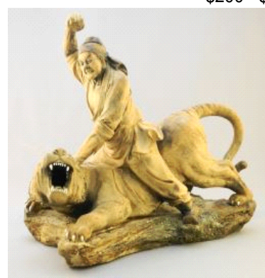
Lot # 88 88 Shiwan Ware Figure of Wu Song & Tiger, 13 1/2" High, note: thumb prints $1,500 - $2,000