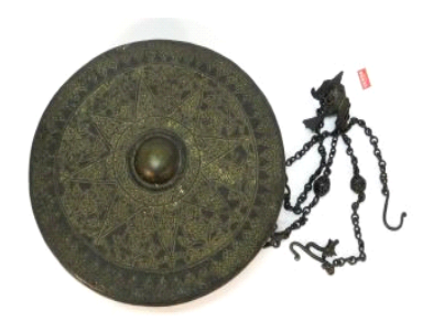
Lot # 18 18 Burmese Bronze Gong & Supporting Chain, 5" x 18 1/2" Diameter.