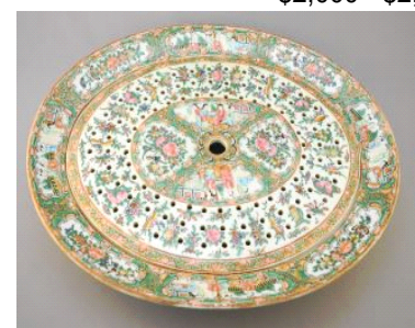
Lot # 122 122 Chinese Canton Enamel Platter with Mazarine, 16 1/2"W, Edge Restoration Noted.