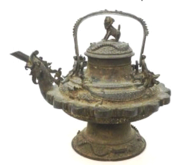
Lot # 118 118 Massive Burmese Bronze Kettle, 19" x 24" x 18".