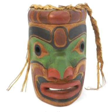
Lot # 49 49 Portrait Mask Signed Ernie Henderson #81, 11 1/2" x 8 1/4" x 6 3/4", Carved & Painted Cedar.