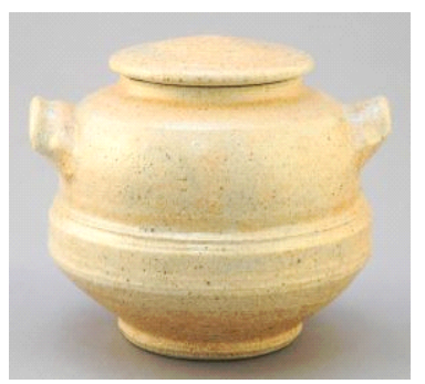
Lot # 129 129 Pale Peached Glazed Stoneware Covered Pot with Faintly Impressed Mark of Wayne Ngan.