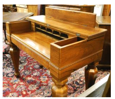
Lot # 148 19th Century Rosewood Spinet Desk Converted, 30" x 45" x 24".