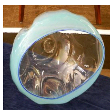
Lot # 151 151 Glass "Paris Basket" Signed (Dale) Chihuly '75, 19 1/2" x 18" x 16". $1,200 - $1,800