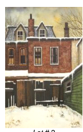
Lot # 2 2 Watercolour Signed (John) Kasyn '75, 13 7/8" x 9 7/8", "Montreal Backyard". $1,500 - $2,500