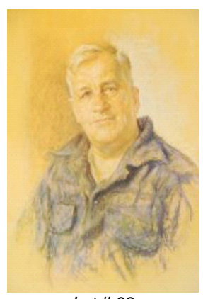
Lot # 38 38 Pastel Signed N.(Nicholas) de Grandmaison, 13 3/8" x 10 3/8", "Portrait Study"