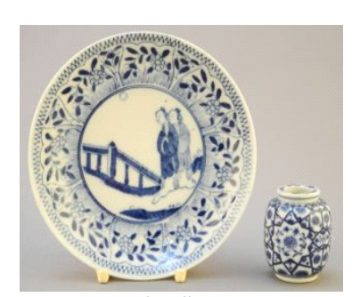
Lot # 67 67 Chinese Blue & White Porcelain Persian Market Miniature Jarlet (1 3/4") and plate.