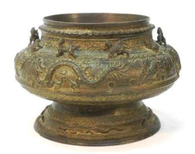
Lot # 121 121 Burmese Bronze Footed Bowl with Insert, 9 1/4" x 15 1/4" Diameter. $2,000 - $2,500