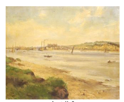
Lot # 6 6 Oil on Canvas Signed W.L. Wyllie 1895, 12" x 16", "Woolwich Fr. Plai- stow Marshes" Resto. Noted