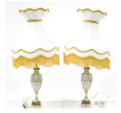
Lot # 39 39 Pair of French Porcelain Table Lamps. $150 - $250