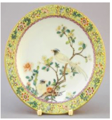
Lot # 57 57 Chinese Enamelled Porcelain Dish with Ruby Back, Qianlong Mark (Overglaze).