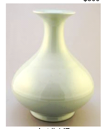
Lot # 147 147 Longquan Celadon-Style Vase with Qianlong Mark, 10 7/8" High. $500 - $800