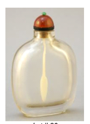
Lot # 96 96 Chinese Rock Crystal Snuff Bottle, No Export, 2 1/2" High.