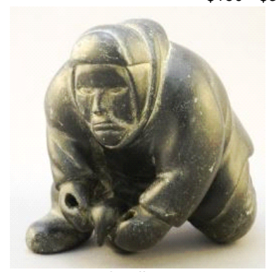
Lot # 74 74 Inuit Stone Figure Signed E9-1481, 4 1/4" High, Processing a Bird. $100 - $200