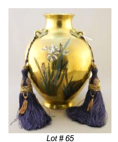
65 Japanese Brass Vase Enamelled with Irises, 11" High.