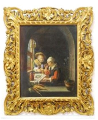
Lot # 161 161 Oil on Canvas Manner of Francois Mieris, 14 1/8" x 12 1/4", "Le Diner Frugel".