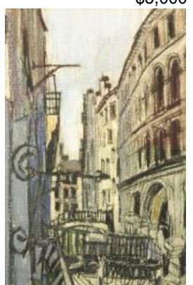
Lot # 135 135 Pastel on Paper Signed Maxwell Bates , 12 1/2" x 8 7/8", "Venice from Hotel Canaletto".