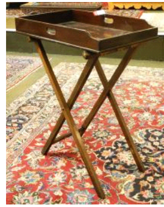
Lot # 158 158 Folding Mahogany Butler's Tray Table, 32 1/4" x 28" x 17 3/4". $100 - $150