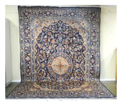
Lot # 144 144 Khorasan Carpet, Approximately 13'2" x 9'10".