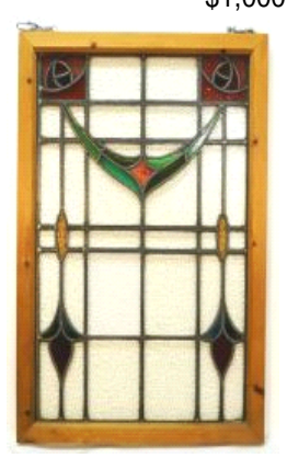
Lot # 52 52 Scottish-Style Leaded Glass Window, Framed, 34" x 21 1/2". $200 - $300