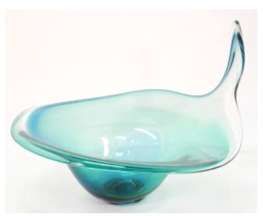
Lot # 155 155 Art Glass Bowl Signed (Dale) Chihuly, 9 3/8" x 16" x 13 1/4". $1,000 - $1,500