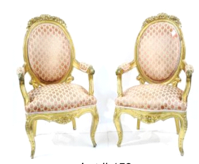
Lot # 159 159 Pair of Louis XV Cameo Back Gilt Wood Armchairs, 41 1/2" High. $400 - $600