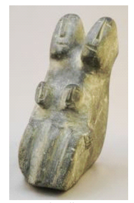
Lot # 73 73 Inuit Stone Carving Attributed To Tutsweetok, 6 1/8" High, Group of Figures