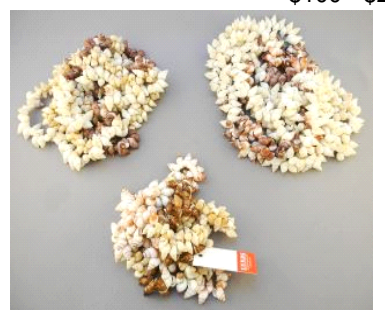
Lot # 70 70 Collection of 3 Tahitian Shell Beads ,Acquired 1930's, 4 1/2"/ 8"/ 9". $200 - $400