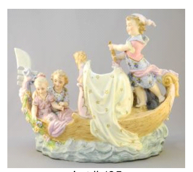
Lot # 125 125 European Porcelain Figural Boat Centerpiece.