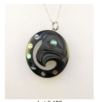
Lot # 130 130 Haida Argillite Pendant Signed Myles Edgers, 1 1/2" Diameter, "Eagle" on Silver Chain.