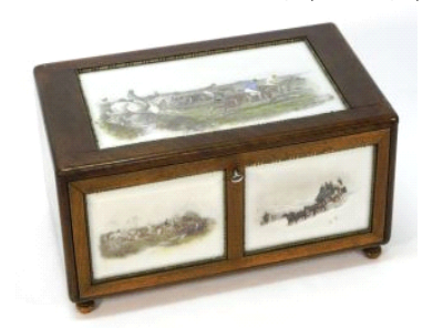
Lot # 145 145 Antique Equestrian Gentleman's Mahogany Large Dresser Box with Hand Painted Equestrian Scene. $200 - $300