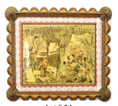
Lot # 84 84 Tramp Art Frame with Lithographic Games Box Cover, Frame 23 1/2" x 29"