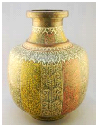
Lot # 153 153 Middle Eastern Copper Alloy & Enamel Vase, 12" High.