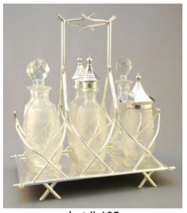
Lot # 108 108 L & WS Silver Plated & Crystal Japonisme Cruet Stand.