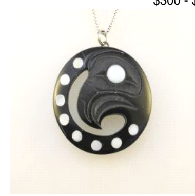
Lot # 94 94 Haida Argillite Pendant Signed Myles Edgers, 1 1/2" Diameter, "Eagle" on Silver Chain.