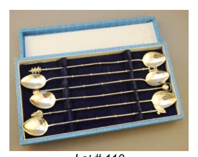
Lot # 110 110 Collection of 6 Sterling Japanese Cocktail Spoons in Box.