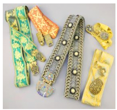
32 Collection of Chinese Metal Work Belt Buckles: Cloisonne/ Gilt/ Enamel.