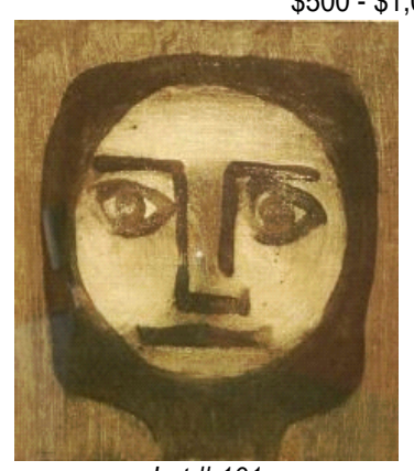
Lot # 101 101 Lithograph Signed H. Siebner '66, 10 1/8" x 10 1/8", "Madchen Mit Zahnwer", #5/25.