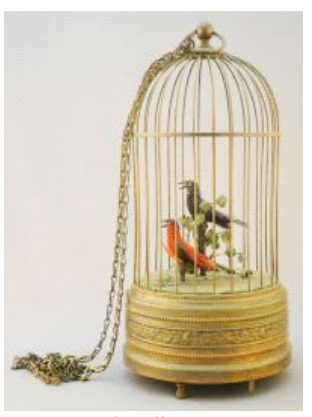
Lot #21 21 Automaton Birdcage, Black Bird Moves/ Emits No Sound, 10 7/8" High, Condition Noted.