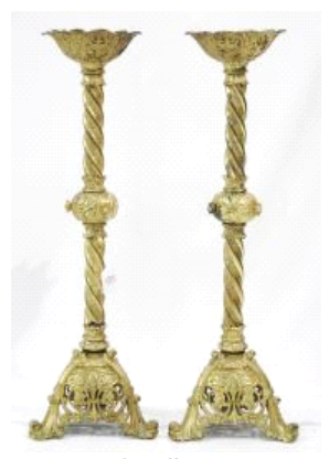
Lot # 97 97 Pair of Gilt Brass Ecclesiastical Candlesticks, 23 3/4".