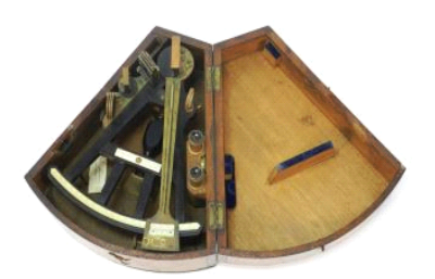
Lot # 75 75 I. Sewill Liverpool Ebony & Brass Sextant in Case, Fittings Noted, No Export.