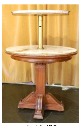
Lot # 123 123 Metamorphic Marble Top Oval Display Table from Erskine Park, 36