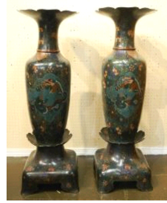
Lot # 4 4 Pair of Japanese Cloisonne Vase & Stands, 43 1/4" High.