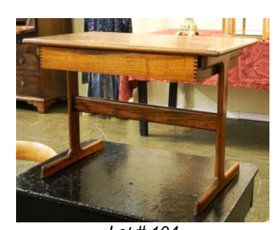
Lot # 104 104 Danish Rosewood Cantilever Side Table, 20 1/2".