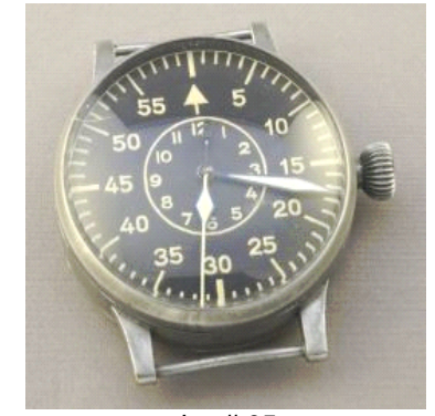
Lot # 35 35 German Laco Pilot Observation Watch, Circa 1943, 2 1/2" x 2 1/2" x 3/4".