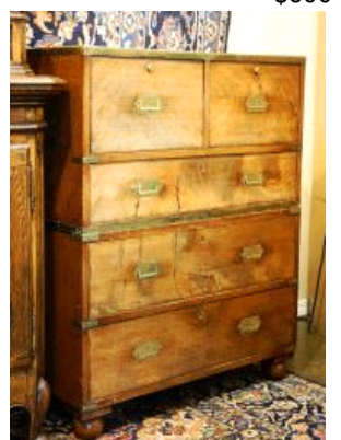
Lot # 15 15 Brass Bound Mahogany Campaign Chest, 35" Wide, As Found. $500 - $800