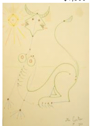
Lot # 12 12 Coloured Drawing signed Jean Cocteau 1957, 16 1/2" x 12 3/4", "Mystical Figure".