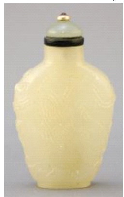
Lot # 128 128 Chinese Hardstone Snuff Bottle, 2 1/2" High, No Export. -