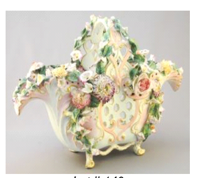
Lot # 140 140 Meissen Floral Encrusted Large Basket, 14 1/2" Wide, As Found/ Flower Chipped.