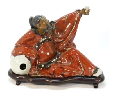
Lot # 40 40 Langyao Glazed Shiwan Ware Figure of Li Po on Stand, 17 1/4" Length. $1,000 - $1,500