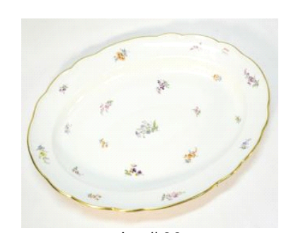
Lot #28 28 Meissen Porcelain Platter, Under Glaze Crossed Swords, 2 5/8" x 21 7/8" x 16 1/4".