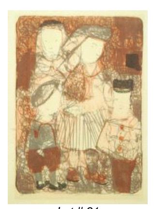
Lot # 91 91 Serigraph Signed Maxwell Bates 1957 3/15, 20" x 15 3/4", "Children".