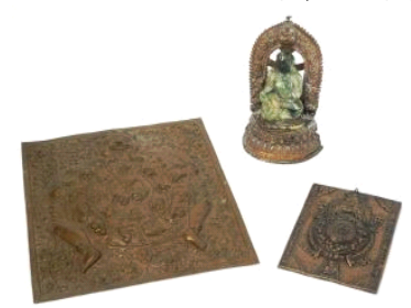
Lot # 141 141 Jade & Copper Figure of the Buddha (6 3/4" High) with Two Buddhist Copper Plaques