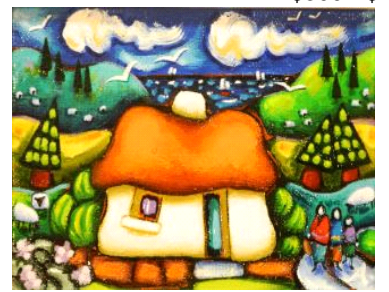
Lot # 48