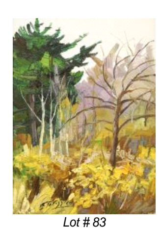
83 Oil on Canvas signed (Armand) Tatossian, 20" x 16", UntitledLandscape.