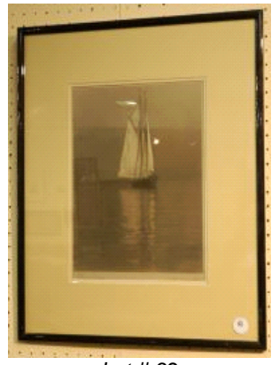
Lot # 92

92 Vintage Photograph Signed W. (Wallace) R. MacAskill, 14 1/8" x 10 1/4", "Grey Dawn".