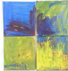
Lot # 15

14 Lithograph signed Jack Shadbolt, 17 x 22", "Secret Garden #5" #32/40. $300 - $500