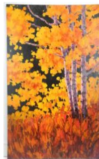
Lot # 98