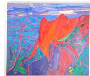
Lot # 131