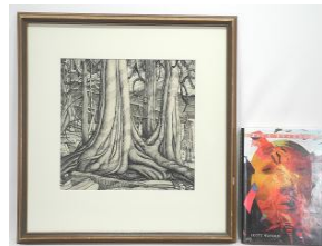
Lot # 144

144 Ink with Graphite Wash by Jack Shadbolt, 14 1/4 x 16", "Rhythmic Roots" w/ Remnant Label.