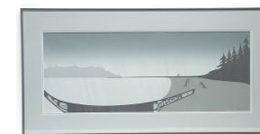
Lot # 51

50 Serigraph signed (Toni) Onley, 12 x 15 3/4", "Doe Run" #28/41. $100 - $200