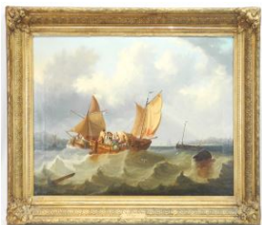
Lot # 112

112 Oil on Canvas signed F.W. Roberts 1826, 23 5/8 x 36", "Dutch Cargo Ships".