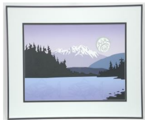
Lot # 90