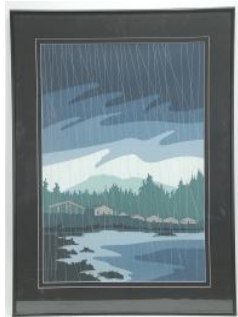
Lot # 132

132 Two Serigraphs signed Roy H. Vickers, 23 1/4 x 17 1/2", "Kitkatla Winter" & "Kitkatla Spring" #34/ $700 - $800