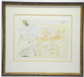
Lot # 159

159 Etching signed Dalí, 18 X 24 1/2", "The Coach & The Fly".