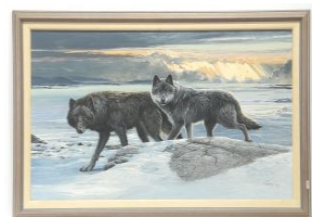
Lot # 34

34 Acrylic on Board signed (Lissa) Calvert, 17 1/2 x 29 1/2", "Pair of Wolves".