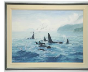
Lot # 178

This Catalogue is available on the Internet at: http://www.lunds.com