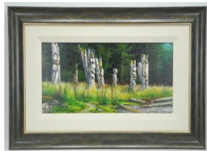
Lot # 113