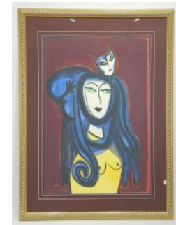
Lot # 181

180 Watercolour signed (Jean) McEwen'74, 16 x 12", "Sans Titre". $1,500 - $2,000