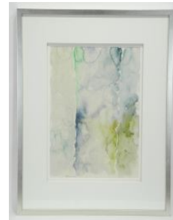
Lot # 180

179 Watercolour signed R.H. Nibbs '86, 17 1/2 x 10 3/4", "Coastal Scene with Ship". $150 - $250