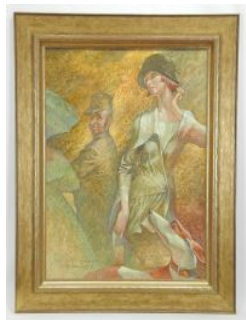
Lot # 107

107 Russian Oil on Canvas signed Van Der Neuman, 25 x 19", "Kokemika".