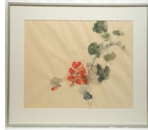
Lot # 160

160 Watercolour signed Molly Lamb B. (Bobak), 17 5/8 x 24", "Flowering Branch".