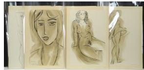
Lot # 65

65 Henri Matisse (8) "Derriere Le Miroir" Lithographs, 16 3/4 x 12 1/4 $800 - $1,200