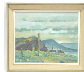
Lot # 76

76 Oil on Board signed (Robert) Genn, "Spring Flowers by an Old Village".