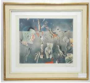
Lot # 158

158 Lithograph signed (Salvador) Dalí, 20 x 26", "Petites Cendres Cenicitas" #50/300.