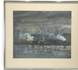
Lot # 166

165 Serigraph signed Georgia Amar, 22 x 36 1/2", "Mid-Summer Evening". $100 - $200