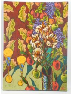
Lot # 173