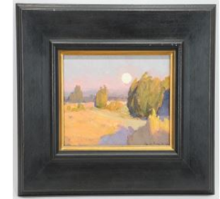
Lot # 168

167 Oil on Board signed (Eric) Bowman, 7 3/8 x 9 1/2", "Lavender Moon". (69) $800 - $1,400