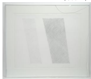
Lot # 66

65 Henri Matisse (8) "Derriere Le Miroir" Lithographs, 16 3/4 x 12 1/4 $800 - $1,200