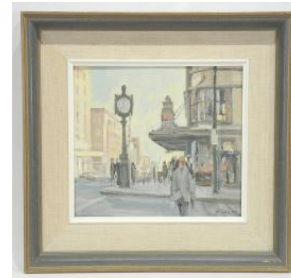
Lot # 7