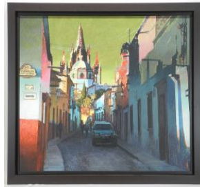
Lot # 18