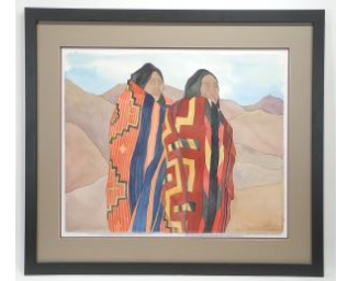
Lot # 9