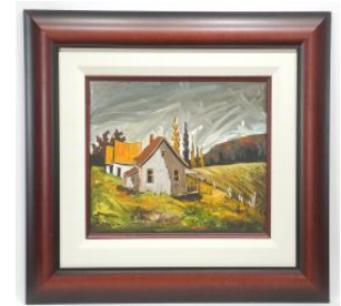
Lot # 10