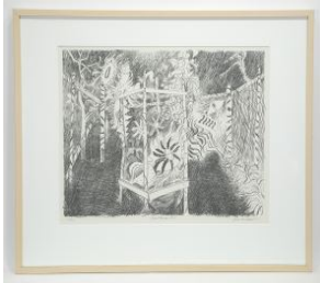
Lot # 14

13 Lithograph signed Jack Shadbolt, 22 x 17 1/2", "Secret Garden #4" #32/40 $300 - $500