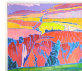
Lot # 106