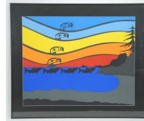
Lot # 2