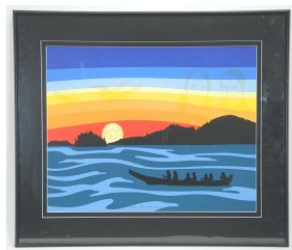
Lot # 143

142 Etching signed Charles Bragg, 6 3/4 x 8 1/2", "Intern" #53/150. $100 - $150