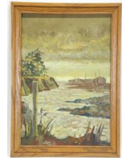
Lot # 127