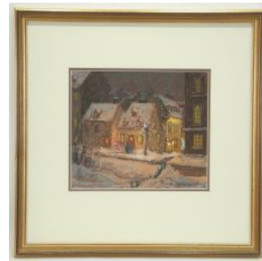
Lot # 64