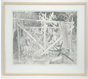
Lot # 12

12 Lithograph signed Jack Shadbolt, 19 x 25", "Secret Garden #6" #31/40. $300 - $500