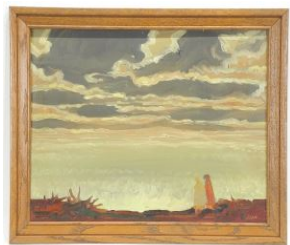
Lot # 59