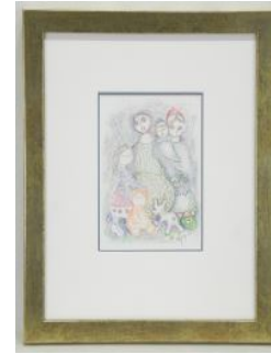
Lot # 19

19 Colour Pencil Drawing signed (Daphne) Odjig, 7 x 5", "In Our Sunday Best" 2008.