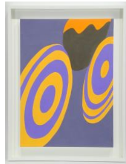
Lot # 174