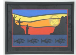
Lot # 8