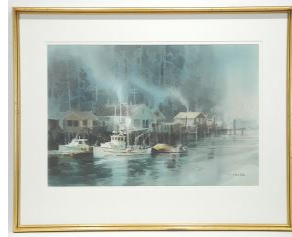
Lot # 176