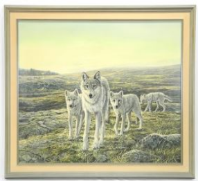
Lot # 23