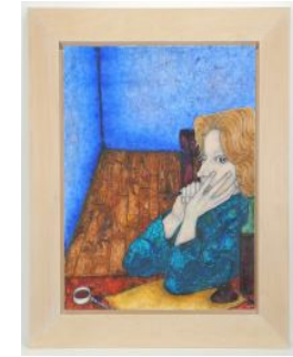
Lot # 21

21 Oil on Board signed Regehr (Duncan), 24 x 19", "The Poet".