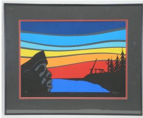
Lot # 54