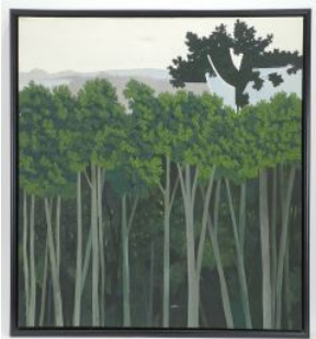
Lot # 88