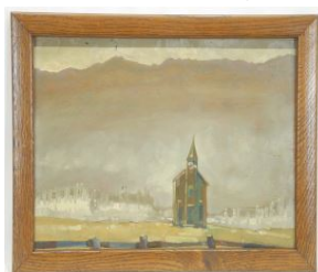
Lot # 32

32 Oil on Board signed Robert Genn, 8 x 10", "July 1, 1972".