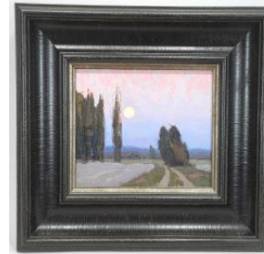
Lot # 167

166 Pastel on Paper signed (Joseph) Plaskett'68, 18 1/2 x 25", "Industrial Waterway". $300 - $500