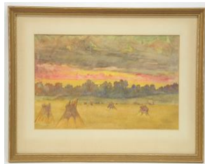
Lot # 138

137 Oil on Canvas signed Bertha Cochrane 1891, 14 x 17", "Still Life w/ Onions". $150 - $300