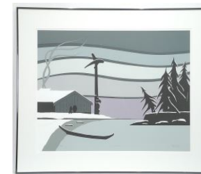
Lot # 103