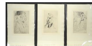
Lot # 150

150 Pablo Picasso (3) "Ballet Sergeheifer (Paris Opera): Lithographs, 10 1/2 x 7 1/2".