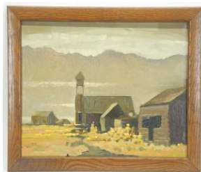
Lot # 31