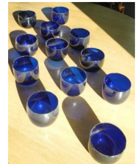
Lot # 44

44 Twelve Bristol Blue Georgian Glass Finger Bowls, 4 3/4" Diameter.