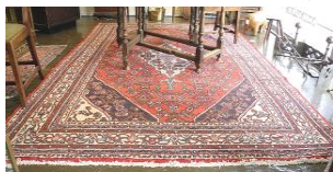
Lot # 53