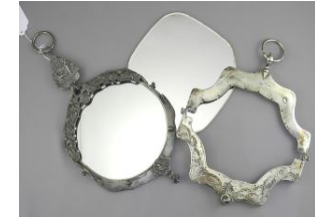
Lot # 86