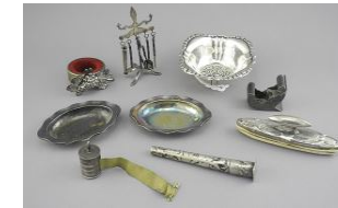
Lot # 169