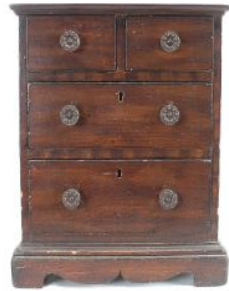
Lot # 100

100 Mahogany & Pine Apprentice Chest, 13 x 10 3/4 x 7 1/2" (base of bottom drawer signed).