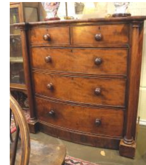
Lot # 132