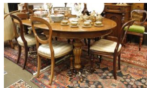
Lot # 349

349 Eight Victorian Mahogany Dining Chairs (6+2), 35 1/2"h.