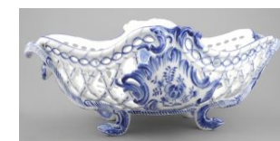
Lot # 176