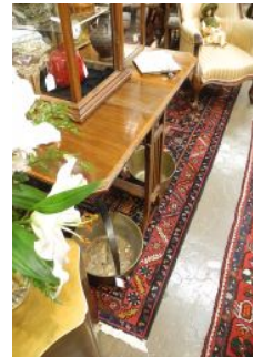
Lot # 382

382 Hand Knotted Ghoche Carpet Approximately 3'4" x 13'4".