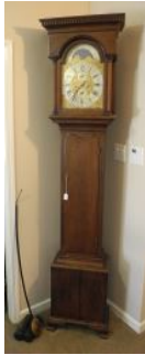
Lot # 21