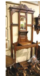
Lot # 251