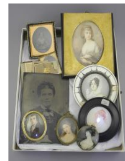
Lot # 329