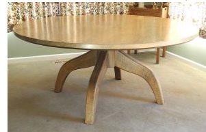
Lot # 193