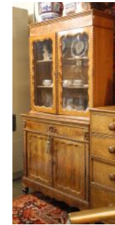
Lot # 301