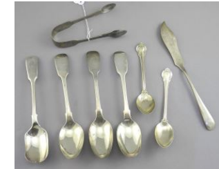
Lot # 208