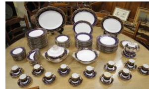
Lot # 192