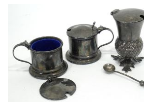
Lot # 330