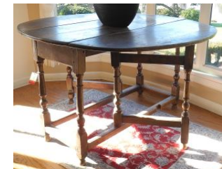
Lot # 47

47 18th C. Oak Drop Leaf Dining Table, 51 1/2 x 47 x 27 3/4"h.