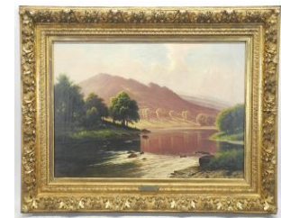
Lot # 14

14 Oil on Canvas signed F. Chwala, 20 3/4 x 31", "Riverscape in Dwindling Sun".