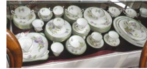
Lot # 238