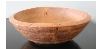
Lot # 45

45 19th C. Georgian Turned Fruitwood Bowl, 18" Diameter.