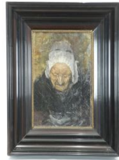
Lot # 189