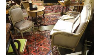
Lot # 366