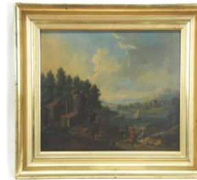
Lot # 80