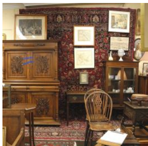
Lot # 144