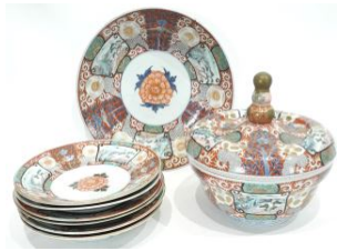
Lot # 343

343 Japanese Imari Porcelain Tureen Stand & Six Dishes.