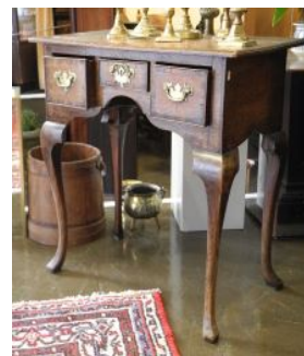
Lot # 42