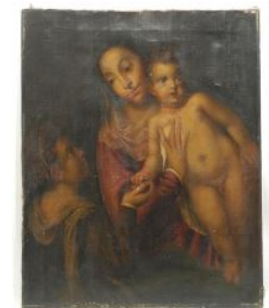
Lot # 338