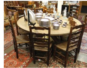
Lot # 194