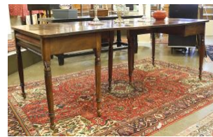
Lot # 319