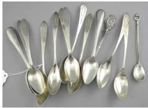
Lot # 375

375 Collection of Dutch Silver Teaspoons , Approximately 5"L, 125g.