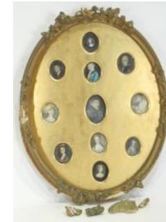
Lot # 241