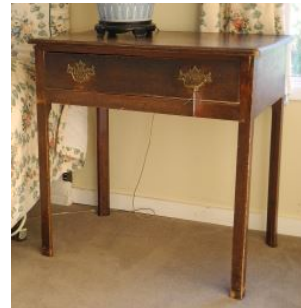
Lot # 150