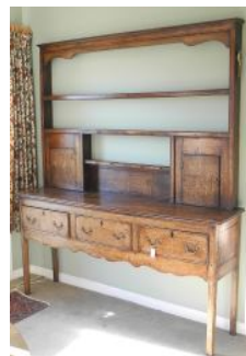
Lot # 36