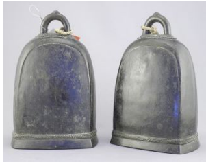
Lot # 185