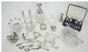
Lot # 260