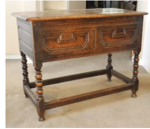
Lot # 104

104 18th C. Oak Dough Bin with Paneled Front, 41 1/2 x 19 3/4 x 29"h.