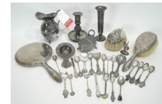
Lot # 210