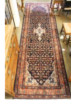
Lot # 78