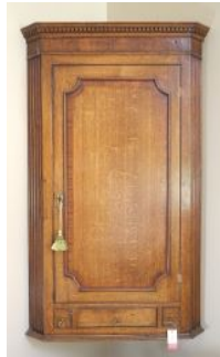
Lot # 308