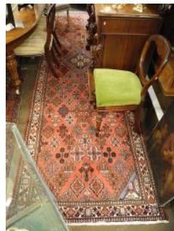
Lot # 350

350 Joshagan Rug Approximately 4'2" x 14'.