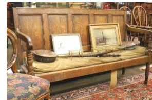
Lot # 201