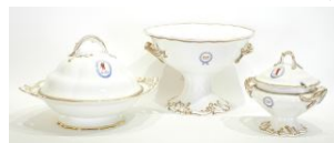
Lot # 273