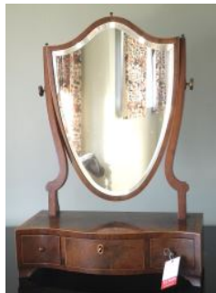
Lot # 345

345 Early Victorian Inlaid Mahogany Shield Shaped Dresser Mirror, 16 1/2 x 8 x 22"h.