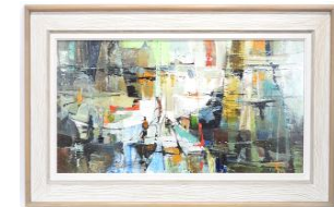
Lot # 11

11 Acrylic on Board signed Adrian Dingle, 17 1/2 x 35 1/2", "Reunion in Rockport" #1640.