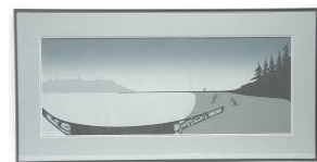
Lot # 99

99 Serigraph signed Roy H. Vickers, 10 1/4 x 28 3/4", "Digging Clams" #2/50.