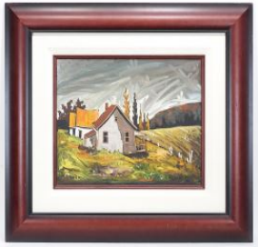
Lot # 156