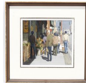
Lot # 152

18 Acrylic on Board signed (Lissa) Calvert, 17 1/2 x 29 1/2", "Pair of Wolves". $300 - $400