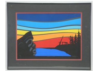
Lot # 81