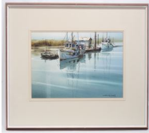
Lot # 12

12 Watercolour signed B. (Brian) Travers-Smith, 13 x 20", "Morning In The Marshes". $250 - $400