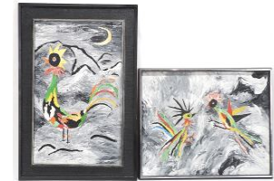
Lot # 28

27 Watercolour signed (Victor) Lotto, 7 x 4 1/2", "Renaze France". $60 - $100