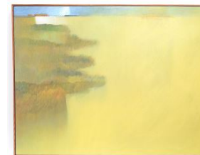
Lot # 141

141 Acrylic Emulsion on Canvas signed Norman Yates, 27 3/4 x 39 1/2", "Landscape Forty-Five", 198