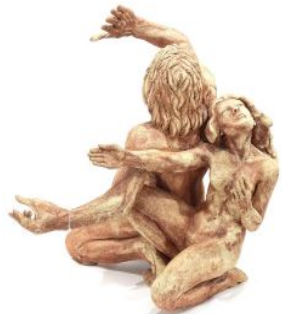
Lot # 131

131 Stoneware Sculpture Attributed to Neil Dalrymple, 15 3/8"h (resto noted).