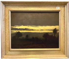
Lot # 66