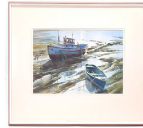
Lot # 150

16 Oil on Board signed (Eric) Bowman, 7 3/8 x 9 1/2", "Lavender Moon". (69) $300 - $600