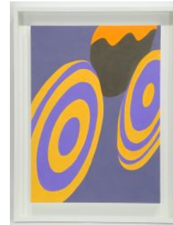
Lot # 102

102 Acrylic on Board signed Sandra Meigs Verso 2013, 20 x 16", "What is the Mind of the Mystic".