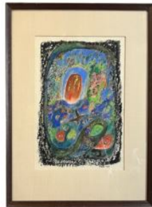
Lot # 149

148 Oil on Board signed (Eric) Bowman, 7 1/4 x 9 1/4", "Blue Moonrise". (24) $300 - $600