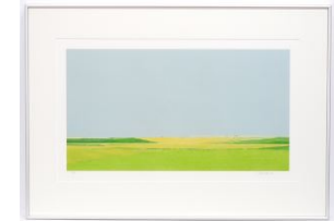
Lot # 9

9 Lithograph signed (Takao) Tanabe '74, 13 3/4 x 26", "The Land-Spring".