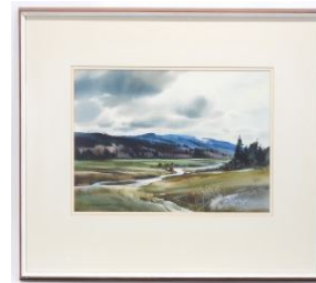
Lot # 151

17 Acrylic on Canvas signed Zaw Win Pei, 59 x 72", "Fauvist Mountainscape". - $600 - $800