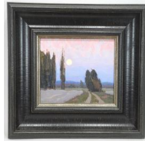
Lot # 16

12 Watercolour signed B. (Brian) Travers-Smith, 13 x 20", "Morning In The Marshes". $250 - $400