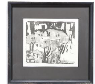
Lot # 10

10 Lithograph signed Maxwell Bates 1966, 16 x 20", "Corsican Town" #12/34.