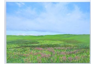
Lot # 29

28 Two Oil on Board by Sohaney (Jack Douglas Wilkinson) One signed '71, Larger 23 x 17 1/4" "Birds $300 - $500