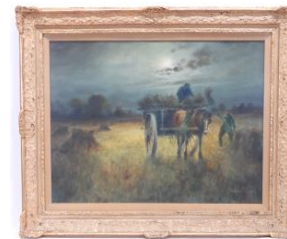
Lot # 7