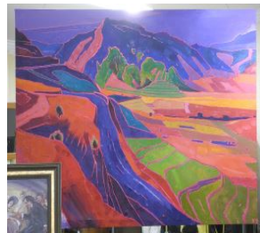
Lot # 17

153 Oil on Board signed G. Rock '73, 5 x 9", "Cowpony Study". $250 - $500