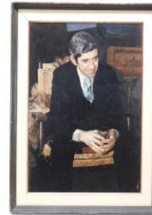
Lot # 19

149 Tempera on Paper signed Pehr (Hallaten) 1960, 11 x 8", "Troll Cave II". $200 - $400