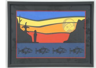
Lot # 82

82 Pair of Serigraphs (A/P), signed Roy H. Vickers, 12 1/8 x 19 5/8", #3/15, "Salmon Moon" & "Legend".