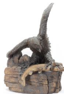
Lot # 138

138 Stoneware Sculpture signed Neil Dalrymple 1979, 23 3/4 x 22 x 11 1/2", "Eagle & Prey".