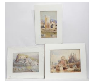
Lot # 84

84 Three Watercolours signed E.G. (Sir Ernest George), Largest 9 x 13", "European Scenes".