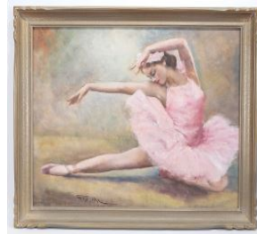
Lot # 133

133 Oil on Canvas signed Fried Pal, 24 x 30", "Ballet Subject".