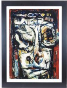
Lot # 111

111 Oil on Masonite signed J. (Joseph) Guinta, 25 1/2 x 20", "Tete".