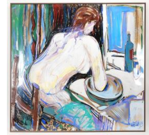
Lot # 106

106 Acrylic on Acetate signed (Paul) Ygartua '95, 33 x 38", "Woman Seated At Vanity".