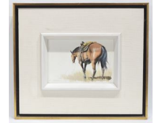
Lot # 153

150 Watercolour signed B. (Brian) Travers-Smith, 13 x 20", "Discards". $250 - $400