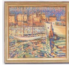
Lot # 1

1 Oil on Board signed I.S.R. (Stella) Langdale, 9 5/8 x 11 1/2", "Harbour Scene".