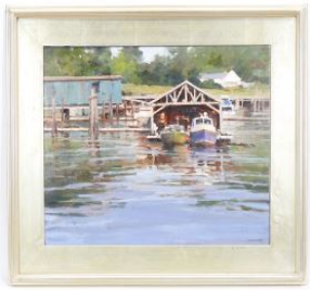
Lot # 145

145 Oil on Panel signed D. (Deborah) L. Tilby, 16 x 20", "Sheltered". $200 - $400