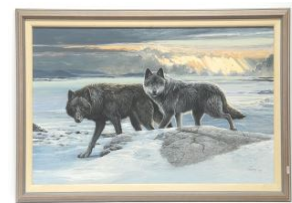
Lot # 18

15 Watercolour signed W.M. Birchall, 8 x 12", "Empress of Australia". $200 - $400