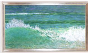
Lot # 90

90 Acrylic on Canvas signed Sylvan Voyer Verso, 23 x 46 1/2", "Lakes Edge".