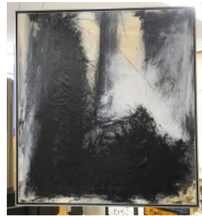
Lot # 112

112 Unsigned Oil on Canvas, 55 1/4 x 55 1/4", "Black Passage".