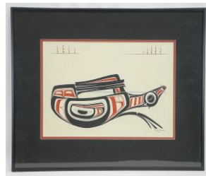
Lot # 98

98 Acrylic on Paper signed Roy H. Vickers, 8 7/8 x 13 3/8", "Northern Fur Seal".