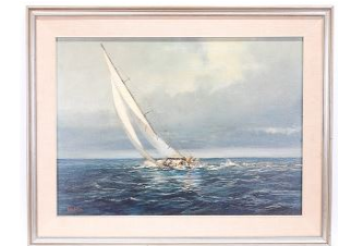
Lot # 155

152 Oil on Board signed G. Rock, 10 x 12", "Sunday Chinatown-Van, BC". $400 - $600