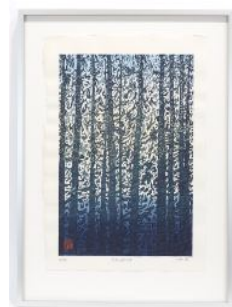
Lot # 140

140 Serigraph signed (Jack) Wise '91, 16 1/4 x 12 1/4", "Rainforest" #10/75.