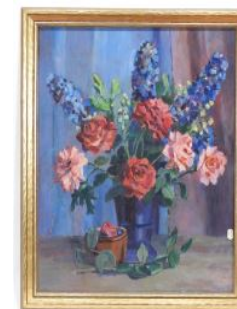
Lot # 143