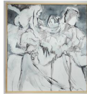
Lot # 78

78 Mixed Media on Board signed Kirsten Brand, 47 1/2 x 47 1/2", "Intertwined Figures".