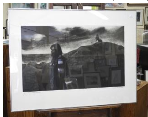
Lot # 44