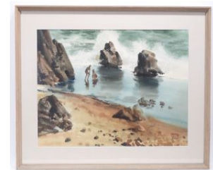
Lot # 62

62 Watercolour signed (Alexander) Kortner, 19 1/4 x 27 1/4", "California Coastline".