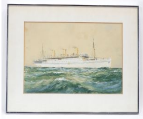
Lot # 15

14 Monoprint signed (Richard) Tetrault, Sheet 22 1/2 x 30", "City Crows Twice #2". $100 - $200