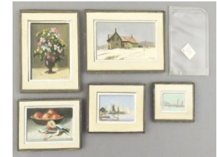
Lot # 122