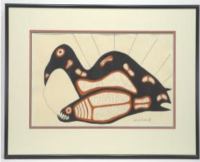
Lot # 128

128 Ink & Tempera on Paper signed Norval Morrisseau, 13 3/8 x 22 1/2", "Loon & Fish".