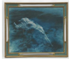
Lot # 134

134 Gelatin Silver Print (blue) signed Curtis L.A., 10 1/8 x 13 1/8", "Floating Aphrodite" C.192