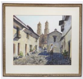
Lot # 41