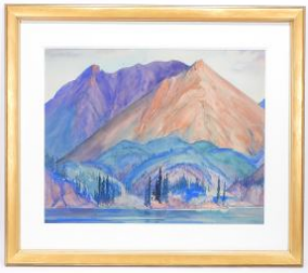
Lot # 157

157 Watercolour signed K. (Katherine) McEwan, 19 1/4 x 26 1/2", "Dusk, Canadian Rockies" 1925.