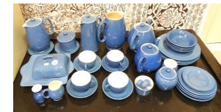
104 Collection of Moorcroft Powder Blue Dishes. $200 - $400