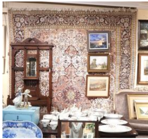
213 Hand Knotted Kashmir Carpet Approximately 8'10" x 11'7". $600 - $800