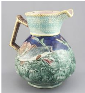
298 English Majolica "Fish & Shell" Pitcher, 8 3/8"h. $500 - $600