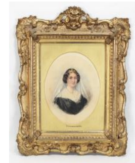
295 Watercolour signed F. (Franz Xavier) Winterhalter, 8 1/4 x 7". $300 - $500