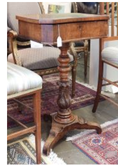
290 Early Victorian Rosewood Sewing Tables, 29 1/4"h. $200 - $300