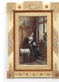
1 Watercolour signed E. (Ernest) Anders '81, 20 5/8 x 12 1/2" "Mere Et Enfant". $300 - $500