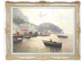
6 Oil on Canvas signed Guido Odierna, 26 1/2 x 38 1/4" "Capri". $300 - $400