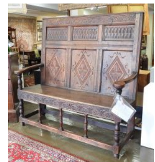
8 17th/18th C. English Oak Settle, Ex: Collection Arthur Pitts, 52 x 58 1/2 x 22 1/2". $300 - $500