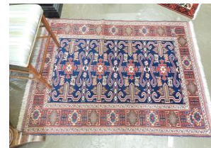
291 Hand Knotted Persian Carpet Approximately 3'7" x 5'2". $200 - $300