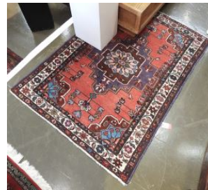
87 Hand Knotted Persian Carpet Approximately 3'7" x 4'11". $200 - $300