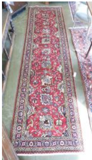
12 Hand Knotted Persian Runner Approximately 2'10" x 9'9". $150 - $300