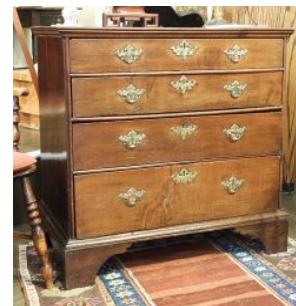
4 Georgian Oak Chest of Drawers, 35 x 38 x 20 3/4". $300 - $500