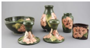
216 Six Moorcroft Hibiscus Wares, 2 3/8 - 5 1/4"h. $200 - $300