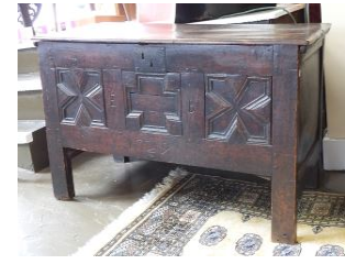
294 Early 18th C. Oak Coffin Dated 1729, 27 1/2 x 45 1/2 x 22". $200 - $400